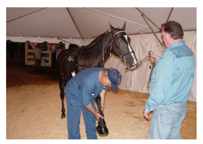
Horses at shows, sales, and auctions are inspected under the Horse Protection Act to eliminate the practice of soring.

do not meet the HPA standards. To ensure that the DQPs continue to adhere to HPA standards, AC personnel evaluate the DQPs' inspection technique and conclusions at some shows and sales.