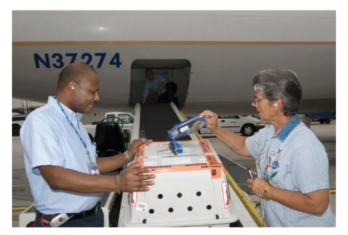
Safe and careful handling of animals in transit on a commercial carrier is assured through Animal Welfare Act regulations.

VMOs and ACIs conduct randomly scheduled, unannounced inspections to ensure that all regulated facilities are in compliance with the standards and regulations of the AWA. If an inspection reveals deficiencies in meeting the AWA standards or regulations, the inspector either instructs the facility