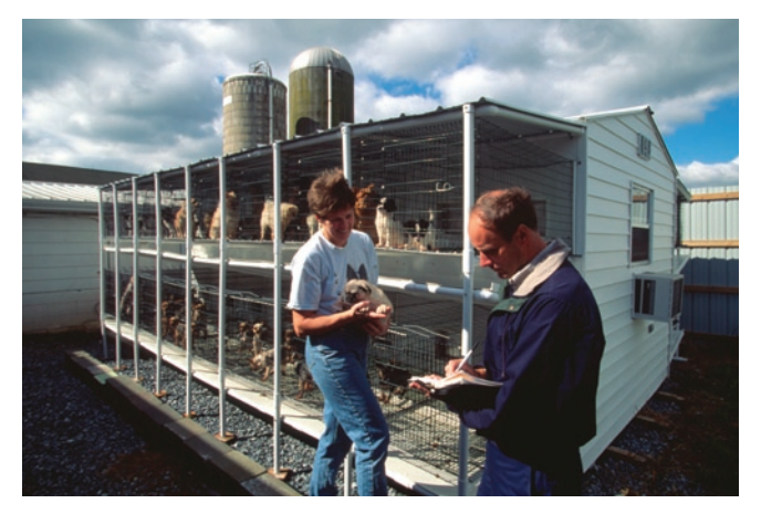
Animal Care's inspectors interact with licensees and registrants on a regular basis to provide education and ensure compliance.

to correct the problems within a given timeframe or, in serious cases of negligence or suffering, recommends formal legal action. Such action could result in immediate confiscations, fines up to $2,500 per violation, and/or license suspension or revocation.