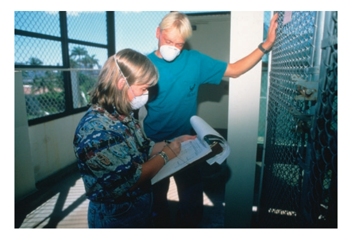
Through unannounced inspections, Animal Care VMOs and ACIs enforce regulations related to humane care and treatment of animals.

"soring." Soring is a procedure that entails applying chemical or mechanical irritants to a horse's pastern to enhance its gait—a practice typically used on certain gaited horses as a cruel shortcut to proper training.