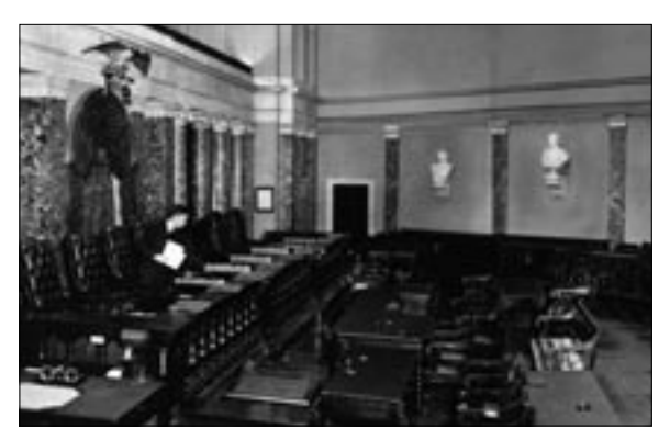
Old Senate Chamber when used by the Supreme Court, ca. 1934

The United States Supreme Court then occupied the room from 1860 to 1935. Modifications at that time included removing the circular balcony and vice president's dais, and installing the Court's bench and marble busts of the early chief justices. The room was later used for committee meetings and other Senate business. In 1976, under the direction of the U.S. Senate Commission on Art, the Old Senate Chamber was restored to its 1850s appearance. In recent years the Senate has used the chamber for occasional closed-door sessions dealing with highly classified issues of national security. In 1999 senators returned to the chamber for an extraordinary joint party conference to draft procedures for the impeachment trial of President William Jefferson Clinton.