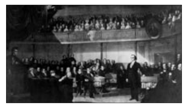
Webster Replying to Hayne, by G.P.A. Healy, 1851

The first of these compromises concerned Missouri's petition to enter the Union as a slave state in 1819. The slavery controversy focused national attention on the Senate, where free and slave states were equally represented, requiring a compromise to resolve the issue. In forging the Missouri Compromise, Congress agreed to admit Missouri as a slave state and Maine as a free state and to bar slavery from all of the remaining Louisiana Purchase lands north of the 36° 30' north latitude, thus preserving the balance of political power between the two factions.