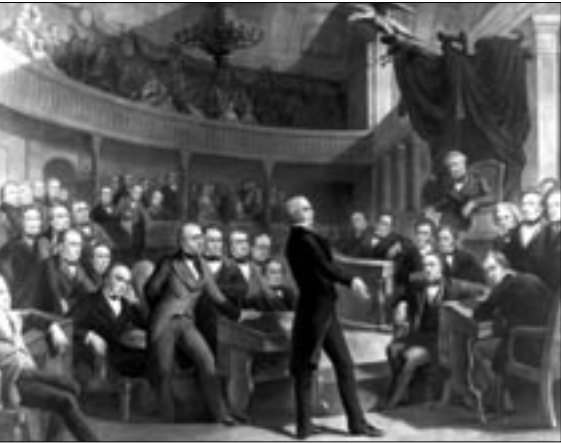
The United States Senate, A.D. 1850 engraved by Robert Whitechurch, 1855, depicts Clay presenting his compromise proposals

bia, and toughening federal fugitive slave laws. The ensuing debates produced dramatic speeches by the three mighty legislators of the era: Clay, Webster, and the dying Calhoun. After months of bitter struggle, Clay's proposals became law.