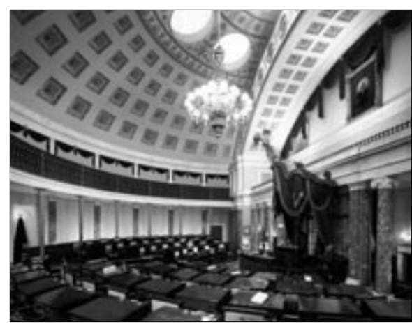
The restored Old Senate Chamber

Today's visitors to the Old Senate Chamber will find reproductions of senator's desks arranged in four semi-circular rows. The original mahogany desks are now located in the present Senate chamber and were made by New York cabinetmaker Thomas Constantine, who in 1819 supplied "48 desks for Members, each $34." Constantine also provided 48 matching chairs; this design is still used today for chairs made for the present Senate chamber.