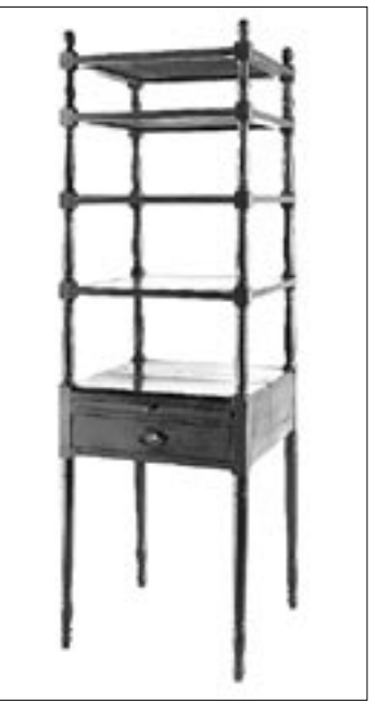
Senate bill hopper, ca. 1817

Also original to the room is one of the two Senate bill hoppers on display. It is believed that the piece was used by the Senate during the early 19th century to store and track bills; as a bill advanced through the legislative process it moved up the shelves of the hopper. It is traditionally held that the upper shelves had less space between them because so few bills survived to become law. The original bill hopper is on loan from the Smithsonian Institution.