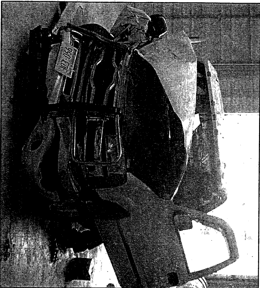
This is the van that hit a tree after the driver fell asleep at the wheel. Except for a broken arm on one passenger, the four people in the van escaped serious injury.