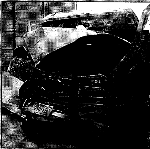
Lola survived (above). The truck didn't, left.

scratch and within three minutes she was smiling and charming the people who came running to help us. I don't know their names, but they deserve a huge "thank you."