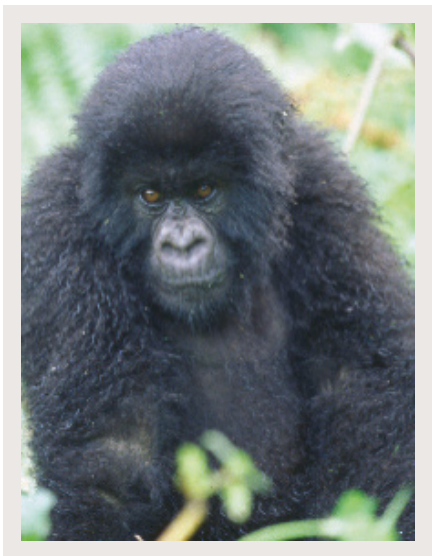
Above: Juvenile Mountain Gorilla