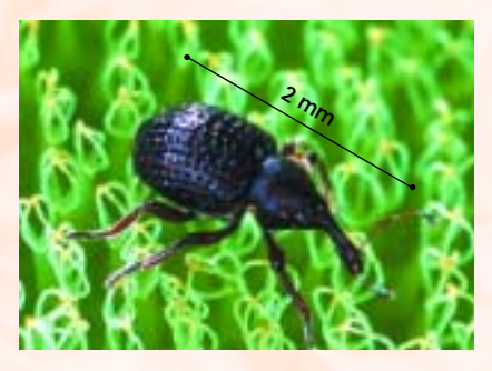
The salvinia weevil Cyrtobagous salviniae and the egg-beater-shaped hairs that repel water from the upper surface of a salvinia frond.

Monitoring and vigilant follow-up control are required to contain salvinia where biological control is not effective.