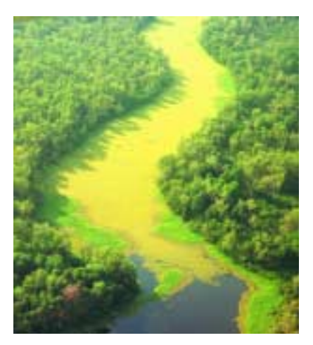
Still or slow-moving waterways are threatened by salvinia: Finniss River, NT, in November.