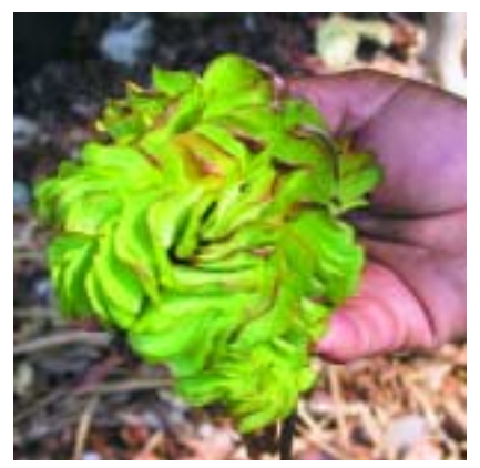
Mature salvinia, showing the overlapping and deeply folded fronds.

survive for many months if the water body dries up, particularly in shaded environments or on soils that hold water. Salvinia also thrives in nutrientrich waters such as agriculture run-off or wastewater. These attributes allow it to colonise most water bodies.