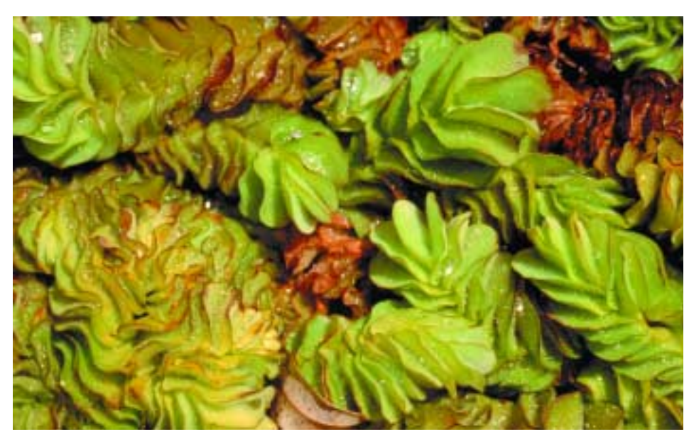
Salvinia forms dense mats that can cover entire waterbodies.

Salvinia is a free-floating fern that forms dense mats on water. It consists of manybranched horizontal stems, 1–2 mm in diameter, which float just below the water surface. At each node, or joint, on the stem is a pair of floating, green,