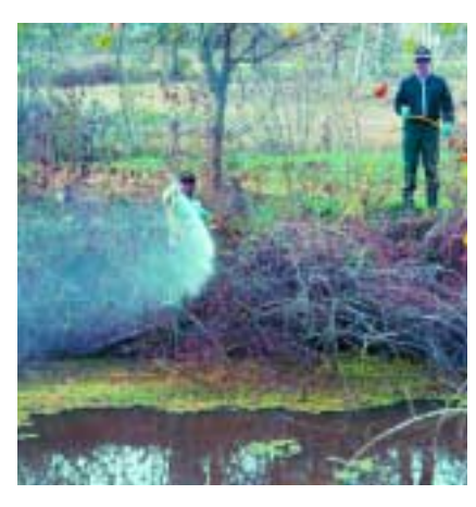
Salvinia in open water can be difficult to reach with conventional herbicides.

When using herbicides always read the label and follow instructions carefully. Particular care should be taken when using herbicides near waterways because rainfall running off the land into waterways can carry herbicides with it. Permits from state or territory Environmental Protection Authorities may be required if herbicides are to be sprayed directly onto water.