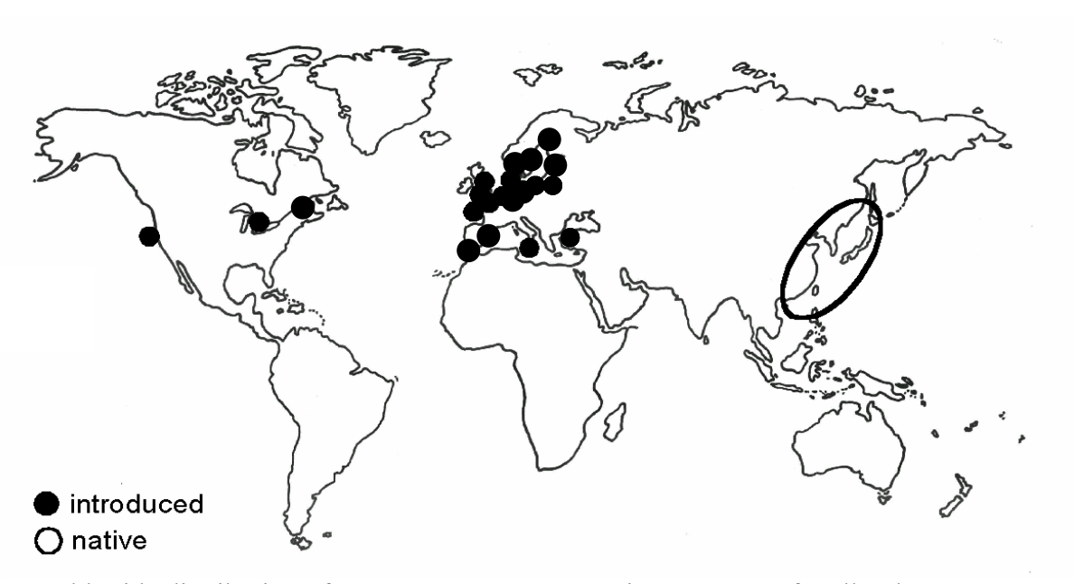
Fig. 4. World-wide distribution of Eriocheir sinensis . Drawing courtesy of Gollasch et al. 1999.

Area of origin are waters in temperate and tropical regions between Vladivostock (RU) and South-China (Peters 1933, Panning 1938), including Taiwan. Centre of occurrence is the Yellow Sea (temperate regions off North-China, see open circle on world map) (Panning 1952).