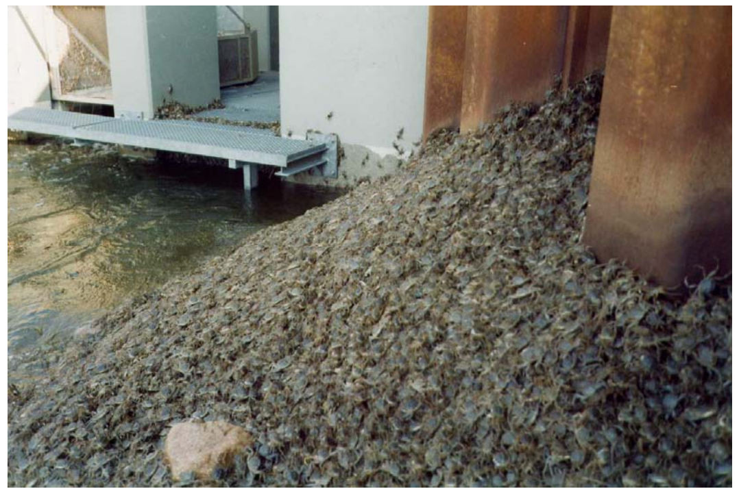
Fig. 2 . Juvenile crabs during mass migration in Geesthacht (near Hamburg, Germany) in 1998, photo by Stephan Gollasch, www.gollaschconsulting.de.