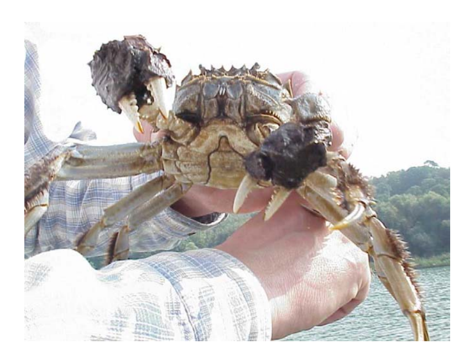
Fig. 1. Adult crab

Common names: Chinese Mitten Crab (GB), Chinese Freshwater Edible Crab (GB), Crabe Chinois (FR), Chinesche Wolhandkrab (NL), Chinesische Wollhandkrabbe (DE), Kinesisk Uldhåndskrabbe (DK), hiina villkäpp-krabi (EE), Kinesisk Ullhåndskrabbe (NO), Kinesisk Ullhandskrabba (SE), Villasaksirapu (FI), Krab wełnistoszczypcy (PL), Kinijos Krabas (LT), Ķīnas cimdiņkrabis (LV), Kitajskij mokhnatorukij krab (RU).