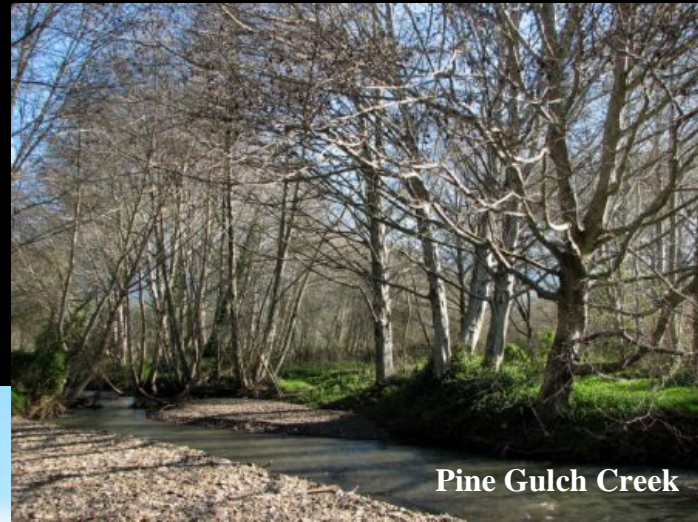
Pine Gulch Creek