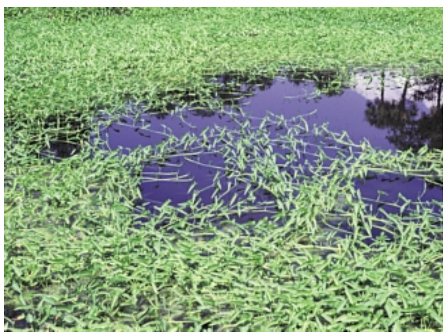
Dense water-spinach mat in a Florida pond.

Because of its aggressive growth rate, never plant water-spinach in Florida's ponds, lakes, rivers and canals. The possession of water-spinach is prohibited without a special permit.