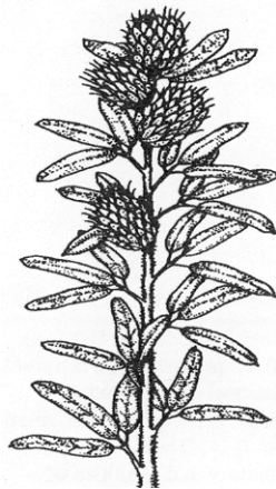
An Illustrated Guide to Iowa Prairie Plants

North, Central and Southern Iowa Germplasm of Roundhead Lespedeza, Zones 1, 2 and 3 originate from locations in the North, Central and Southern counties in the state of Iowa, thereby making these accessions well adapted to these counties.