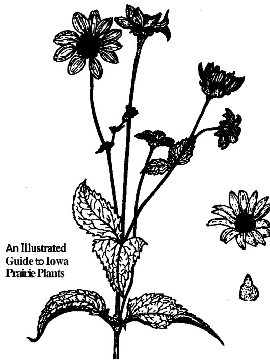
An Illustrated Guide to Iowa Prairie Plants

The seed is smooth, four-sided achene, without pappus, but retaining ray at maturity.