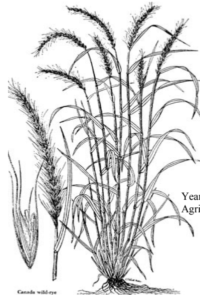
Yearbook of Agriculture 1948

North, Central and Southern Iowa Germplasm of Canada Wildrye, Zones 1, 2, and 3 originate from locations in the Northern, Central and Southern