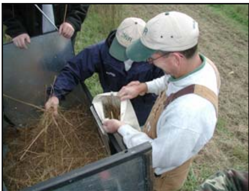
Southlow Michigan Germplasm indiagrass harvest

USDA NRCS Plant Materials Specialist 3001 Coolidge Rd. Suite 250 East Lansing, MI 48823 Phone: (517) 324-5242 Fax: (517) 324-5171