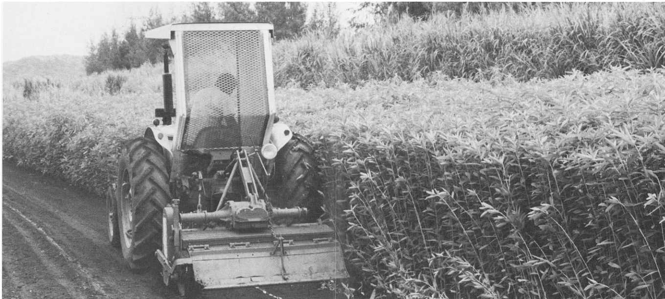
Rototilling in a crop of Tropic Sun at about 50 days

Tropic Sun seed should be broadcast and covered or drilled about ½ to 1 inch deep in a well-prepared, weed-free seedbed. A soil test should be taken, and fertilizer and other soil amendments applied as recommended. In lieu of a soil test, 100 to 150 pounds per acre of P 2 O 5 can be applied as superphosphate, 0-20-20 fertilizer or the equivalent. Calcium carbonate, to adjust pH to at least 6.0, and phosphorus are needed for maximum production of organic matter and nitrogen. The phosphorus can also be used by the succeeding cash crop.