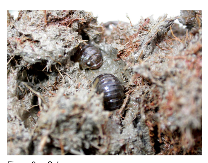
Figure 9. Sphaeroma quoyanum

et al. 2001). Sphaeroma burrows into a variety of substrates including wood, soft rock, and salt marsh peat. It prefers the salt marsh peat of Salicornia spp. dominated marshes and is found predominately high in the intertidal zone on bay-front rather than creek edge marsh banks. It is most common on vertical and undercut banks where it forms horizontal burrows averaging 2 -cm long and 0.7 cm wide. These generally intersect other burrows producing a "swisscheese" like texture that significantly weakens the bank eventually resulting in undercutting, collapse of the marsh edge, and severe erosion (Figure 10).