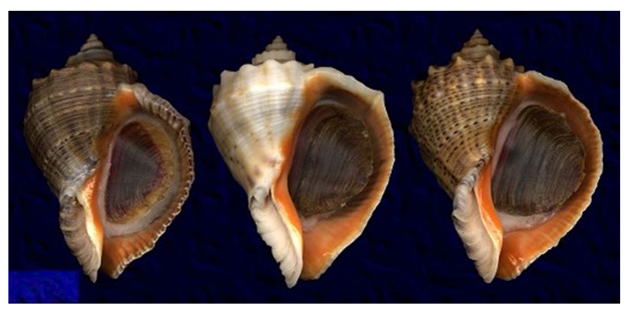
Figure 7. The Veined Rapa Whelk, Rapana venosa

Salinity appears to be a major factor determining the distribution of Rapana , particularly during its larval and juvenile stages. O'Neill (2001) reported that larvae begin to suffer mortality during 48-hr exposures to salinities below 15 ppt and cannot survive exposure at 10 ppt. The North American distribution of this species is limited to portions of Chesapeake Bay. Mann and Harding (2003) predict that bay currents will spread it to most of the lower western shore of the bay and even in the absence of separate introductions, it is likely to spread from Cape Cod to Cape Hatteras.