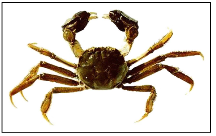
Figure 2. Chinese Mitten Crab, Eriocheir sinensis

The Chinese mitten crab Eriocheir sinensis (Figure 2) first appeared as an invasive species in German waterways during the early 1900's and has since spread through much of Europe (Clark et al. 1998). Detected in Lake Erie in 1973 (Nepszy and Leach 1975), it has since