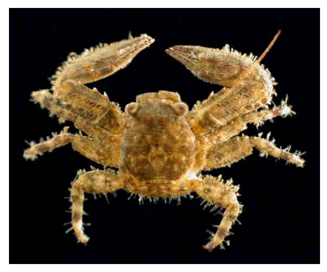
The Green Porcelain Crab, Petrolisthes Figure 8. armatus

inadvertently introduced outside its normal range. Hartman et al. (2001) suggest that the abundance of P. armatus may indirectly damage ovsters by providing an alternative prey for predators of xanthid crabs. Xanthids feed on ovster spat, therefore, anything that reduces predation pressure upon them may lead to increased predation on spat. Field experiments by Hollebone and Hay (2003) support this conclusion.