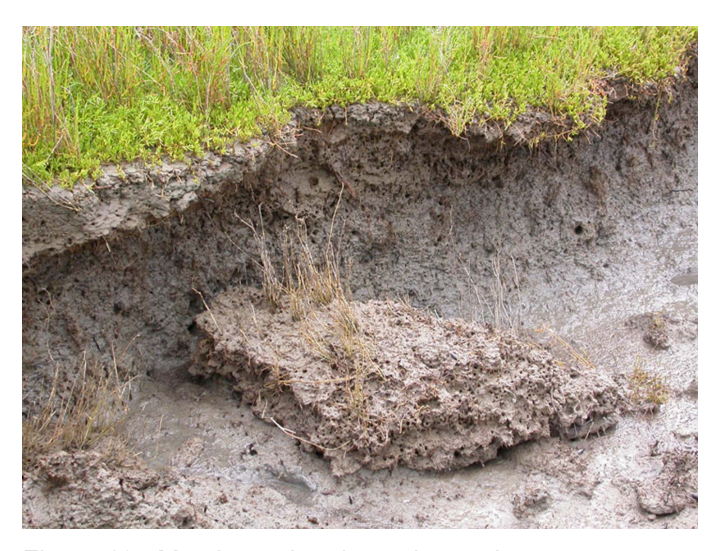
Figure 10. Marsh erosion due to burrowing

Sphaeroma appears to be a filter feeder; therefore, it does not actually consume the peat during burrowing (Talley et al. 2001). It can achieve densities as high as 8,000/\text{m}^2 . This species clearly has the potential to interfere with the long-term success of USACE wetland restoration efforts, however, it may be