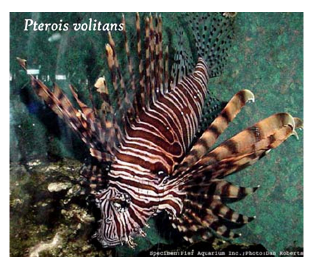
Figure 12. The Lionfish, Pterois volitans

It is presently found from Florida to Cape Hatteras, North Carolina. Although it is unlikely that breeding populations will be established further north than the Carolinas. juveniles have been reported as far north as Long Island, New York during the summer (Gare and Whitfield 2003). Lionfish are ambush predators that fed mostly upon small fish, crabs, and shrimp. Their effect on local ecosystems has not been assessed.