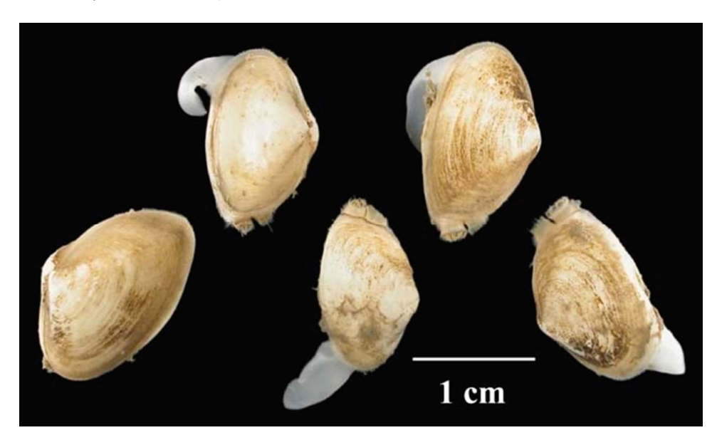
Figure 1. Potamocorbula amurensis

In 1987, scientists examining bottom communities in San Francisco Bay encountered a species of clam not previously found there. Eventually identified as the Amur River Corbula clam, Potamocorbula amurensis (Figure 1), a resident of Chinese, Japanese, and Korean waters, the roughly 2.5-cm- (1-in.-) long clam quickly spread throughout the estuary. As it spread it displaced resident benthic assemblages (Carlton et al. 1990, Nichols et al. 1990). By the early 1990's, it had reached sufficient densities that significant declines in bay phytoplankton, an important link in the bay food chain, were attributed to its filter-feeding activities (Alpine and Cloern 1992). Before the clam invasion, phytoplankton had a small annual peak in abundance in early spring and a larger one in late summer. After introduction, the spring peak declined, and the summer peak virtually disappeared. The reduction in phytoplankton availability had ramifications throughout the bay food web, including reduced zooplankton and fish abundance and altered feeding habits of resident fish (Kimmerer et al. 1994, Feyrer et al. 2003).