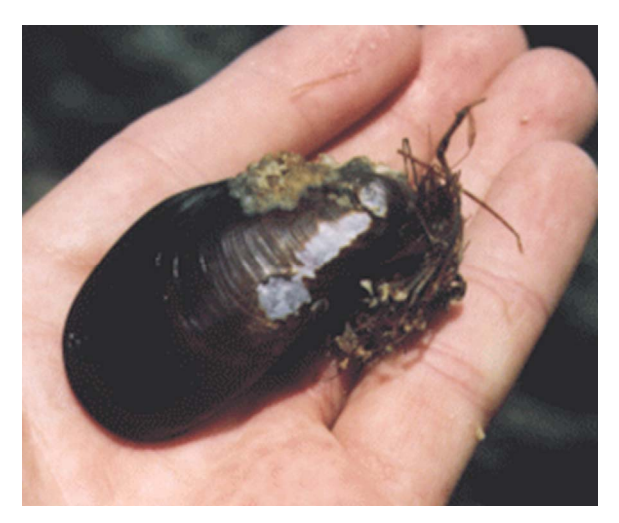
Figure 4. The Brown Mussel, Perna perna

Perna perna, the brown mussel, is also a potential threat (Figure 4). A native of South Africa, it has successfully invaded South America from Uruguay to the Caribbean (Gulf States Marine Commission 2003). It was first detected in the United States on a Port Aransas, Texas jetty in 1993 and is now distributed from Freeport, Texas to Veracruz, Mexico (Hicks and Tunnel 1993, 1995). Slightly smaller than its congener, the brown mussel shares most of its biological