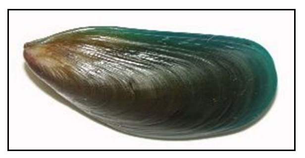
Figure 3. The Green Mussel, Perna viridis

Perna viridis, the Asian green mussel, is native to the tropical Indo-pacific with populations distributed between the South China Sea and the Persian Gulf (Figure 3). It first appeared in the western hemisphere in Trinidad in 1990 (Agard et al. 1992), then in Venezuela (Rylander et al. 1996) and in