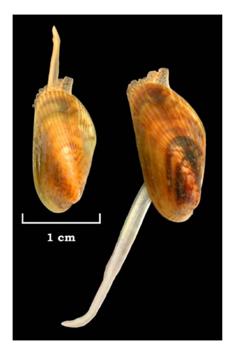
Figure 5. The Asian Date Mussel Musculista senhousia

The date mussel grows to about 32 mm total length, most of which (25 mm) occurs in the first of its two-year life span (Crooks 1998, Mistri 2002). It produces planktonic larvae that can remain in the water column as long as 55 days. The larvae preferentially settle out on muddy or sandy substrates. This species forms dense beds that significantly alter nearby sediments and native benthic assemblages (Crooks