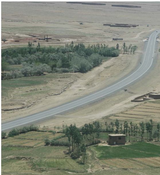
Pul e Alam Road, Logar, 2006.

Jalalabad-Asmar Road (124 km) – The Jalalabad-Asmar road is well on its way to completion. The first 51kms of the road have been completed and paved. The estimated completion date is April 2007. 101km of first layer of DBST surfacing completed; 51km of the 2 nd layer complete. All stone masonry work complete.