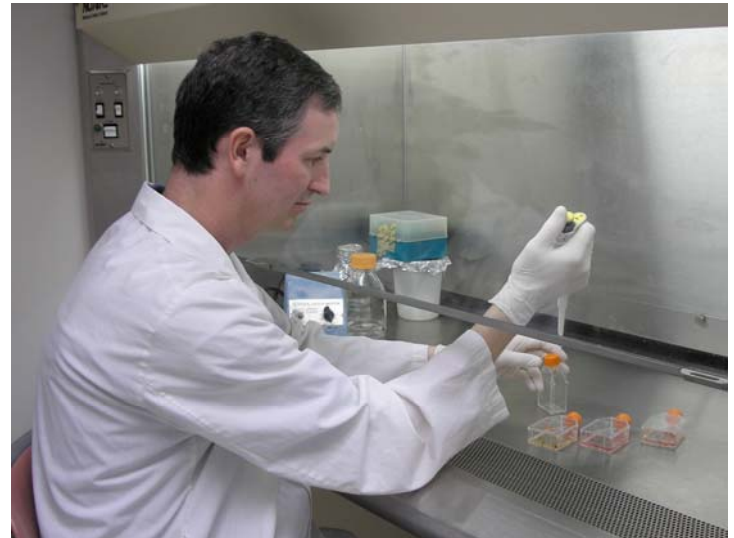
Cell culture and molecular assays are used for the detection and identification of fish viruses.

As of mid-2007, VHSV strain IVb has been isolated from fish in Lake Michigan, Lake Huron, Lake St. Clair, Lake Erie, Lake Ontario, the Saint Lawrence River, inland lakes in New York, Michigan and Wisconsin as well as the coastal areas of eastern Canada. The new strain has an exceptionally broad host range and has been isolated from over 25 species of finfish to date. Significant mortality has been reported in muskellunge, freshwater drum, yellow perch, round goby, emerald shiners and gizzard shad.