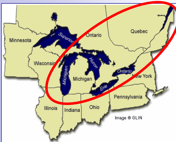
Sites of VHSV IVb isolation in the Great Lakes as of summer 2007.