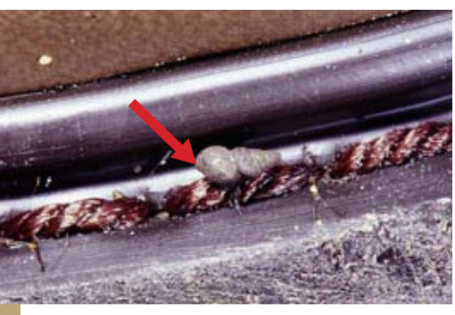
Mudsnails on the seam of a stream boot. Unintentional transport from one stream location to another by hitchhiking on waders or wading boots is one of the primary vectors for spreading New Zealand mudsnails.

Mudsnails can tolerate a wide range of habitats, including brackish water, and are found living in high densities (often over 400,000 snails/sq meter) on many different substrates (rock, gravel, sand, and mud).