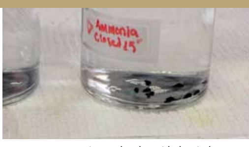
New Zealand mudsnail in test chamber with chemical test solution.