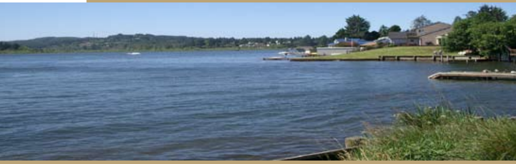
Devils Lake, Oregon, is heavily infested with New Zealand mudsnails. Prevent the spread of New Zealand mudsnails by cleaning gear and boats and not moving water from infested waters into new bodies of water.