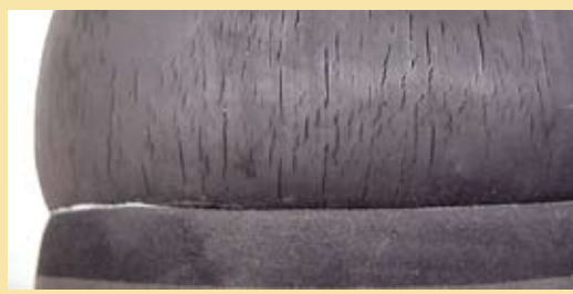
The toe of this rubber wader boot has cracked after being exposed to repeated applications of benzethonium chloride. (Photo by Robert Hosea.)

A worker filters the cleaning solution after removing wading gear. (Photo by Robert Hosea.)