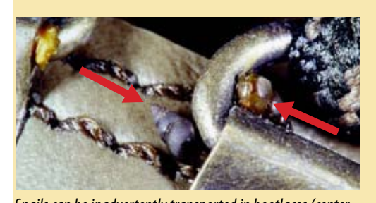
Snails can be inadvertently transported in bootlaces (center—note different color).

Range expansion of the mudsnail has been unwittingly hastened by anglers, hunters, and field personnel—in other words, people who frequently move between streams and lakes in watersheds, hauling wet waders, nets, and other gear with them. Once the mudsnail is established in a new habitat, it is impossible to eradicate it without damaging other components of the ecosystem. Thus, inspecting, removing, and treating gear before moving to a new water body is the most effective means of preventing the spread of mudsnails.