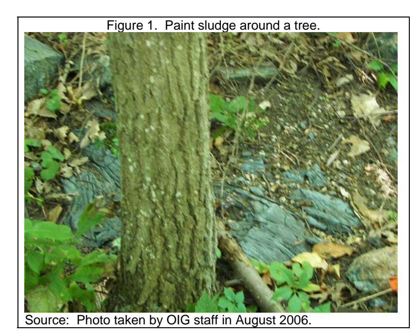
Testing by NJDEP in 1982 found that groundwater and surface water in the area were contaminated with volatile organic compounds, lead, and arsenic. This testing led to EPA adding the Ringwood Mines/Landfill site (Ringwood site or site) to the NPL in 1983. The NPL is a list of the most serious hazardous waste sites in the United States identified for possible long-term cleanup. The Ringwood site consists of approximately 500 acres in a block of land about one-half mile wide and one and one-half miles long. It consists of rugged forest

areas, open areas overgrown with vegetation, abandoned mine shafts and surface pits, an inactive landfill, an industrial refuse disposal area, a municipal recycling area, the Ringwood maintenance garage, and about 50 private homes.