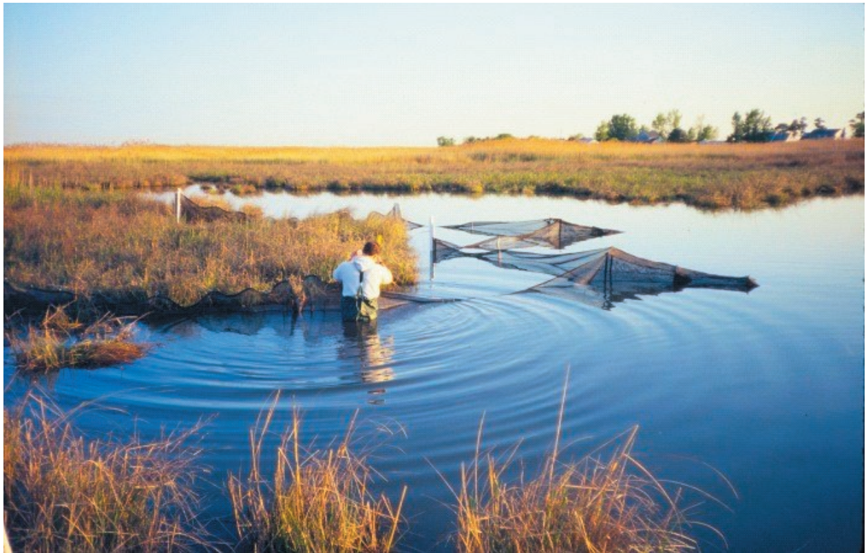
Figure 13. Fyke net sampling along Marshy Creek North, Knapps Narrow, Maryland.