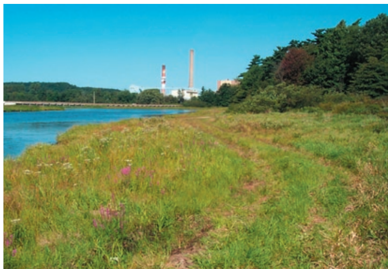
Figure 17. Port Sheldon in 2001 after seedbank germination and colonization of exposed substrate by wet meadow vegetation.

Experimental studies can be performed onsite in conjunction with restoration and monitoring. Restoration science will continue to be refined through carefully planned and executed experiments and peer-reviewed manuscripts. Controlled, replicated field experiments can illustrate successes and failures in restoration methodologies and techniques. Both successes and failures need to be documented and published to further restoration science. In many instances, these experimental studies could be built into select restoration projects through dedicated funds.