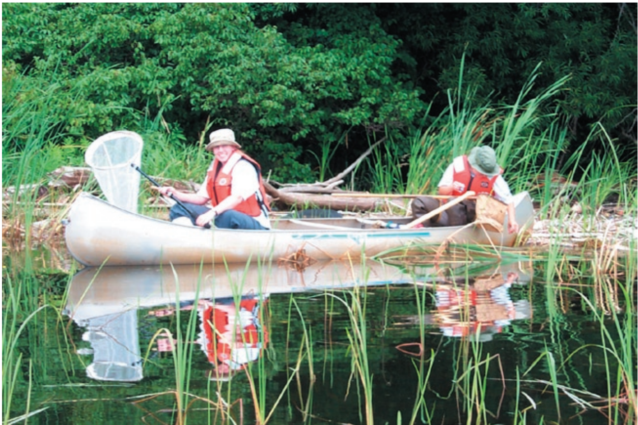
Figure 12. Using a canoe to sample for adult insects in a marsh on the Black River in New York along Lake Ontario.

Export of data, results, and “lessons learned” — To be useful, monitoring data, results, and “lessons learned” have to be shared. Information resulting from a well-designed and conducted monitoring program supports the timely and successful management of on-going restoration projects. Project managers can use results in adaptive management to make mid-course corrections in the operation of project features. Additionally, monitoring information regarding the performance of both a project overall and its constituent features is highly useful to individuals designing current and future projects with similar features and goals or in similar habitats. Monitoring data, results, and a discussion of lessons learned should be made available through a publicly available source such as a well-advertised web page. A goal of this process should be the long-term reduction of monitoring costs through implementation of increasingly efficient approaches.