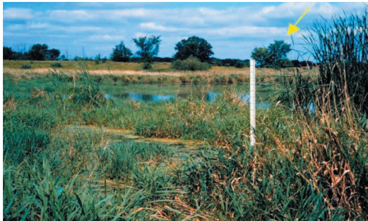
Figure 15. Freshwater marsh in late summer.

Figures 14 (spring) and 15 (late summer) are photographs taken from different vantage points of the same marsh (yellow arrow marks landmark trees in the background) in southeastern Michigan. These photos illustrate the importance of accounting for seasonality in restoration monitoring. Monitoring projects that seek to compare restored vegetation communities over time or compare reference areas to restored sites should take measurements as close to the same time each year as possible to ensure comparability of data.