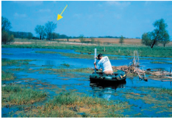
Figure 14. Freshwater marsh in spring.

and not attributed to the restoration effort. Resources, however, may not provide for such a rigorous sampling schedule. In these cases, sampling of specific parameters in reference areas should take place during the same time of year as sampling in restored areas. For example, since herbaceous plant communities change throughout the year, sampling in restored and reference sites needs to occur during the same season (preferably the same month). This is true also for sampling of invertebrates, fish, migratory