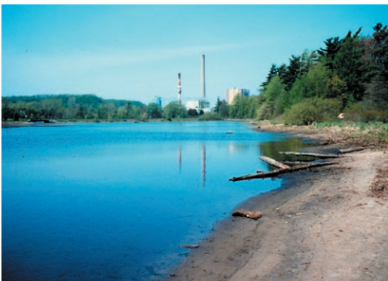
Figure 16. Sediments at Port Sheldon drowned-river-mouth wetland in the Great Lakes area exposed by low lake levels in 1999.

After extensive review of monitoring programs and plans of similar projects, work in similar habitat types, or plans that overlap geographically with the project in question, monitoring planners should outline the project design and rationale, sampling frequency, and characteristics of interest and link them to project goals. The sampling methods and approach should be described in detail for review and should be based on sound statistical sampling design. Additionally, the number of sampling stations, location of those stations, and the number of samples collected are critical decisions that impact the power of the analyses. It is strongly recommended that a statistician be consulted. Whenever possible, the sampling methods used should be non-destructive.