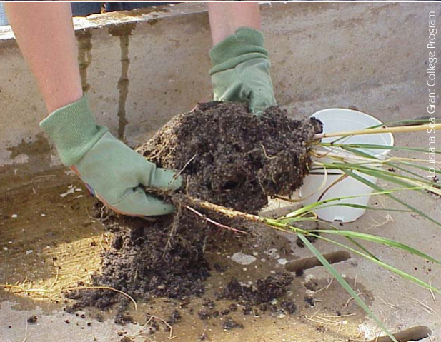
Louisiana Sea Grant College Program