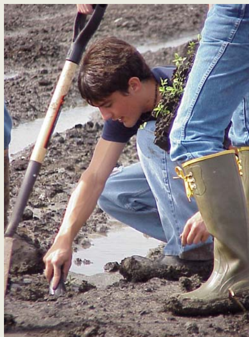
Louisiana Sea Grant College Program

THE KIDS WHO PARTICIPATE IN COASTAL ROOTS are not only learning about the crisis facing Louisiana's wetlands — they're also helping to solve it.