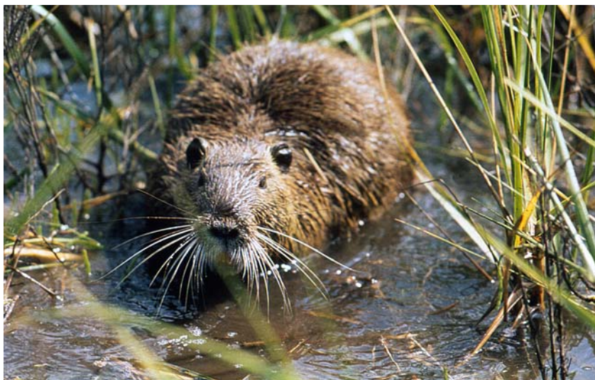
National Wetlands Research Center

"Think of sediment in a new CWPPRA project as