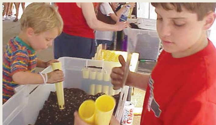
Louisiana Sea Grant College Program