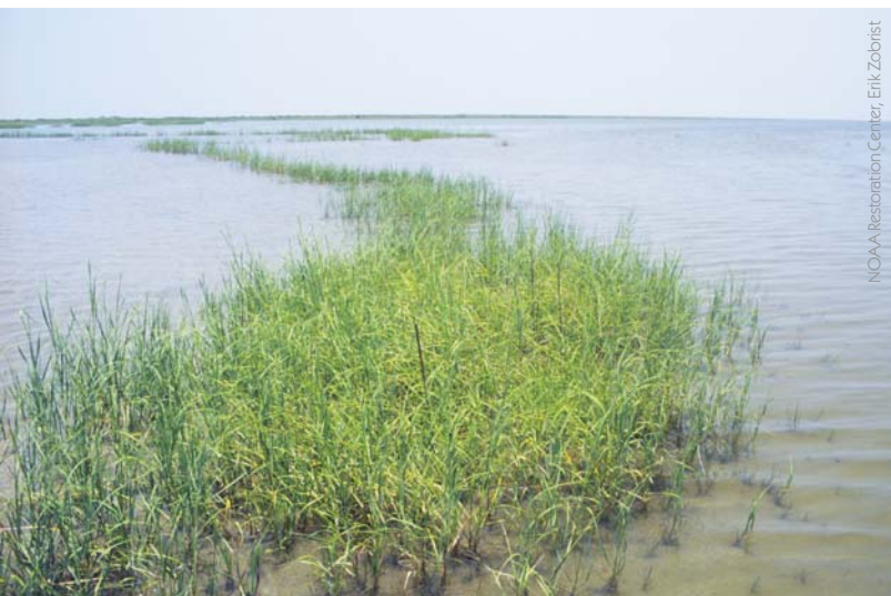
NOAA Restoration Center, Erik Zobrist

Because the ecosystem of Louisiana’s marshes is so destabilized, plants need help to save the wetlands. Many projects funded by the Coastal Wetlands Planning, Protection and Restoration Act (commonly known as the Breaux Act) involve engineering, such as designing water control structures to regulate tidal flow, stabilizing shorelines