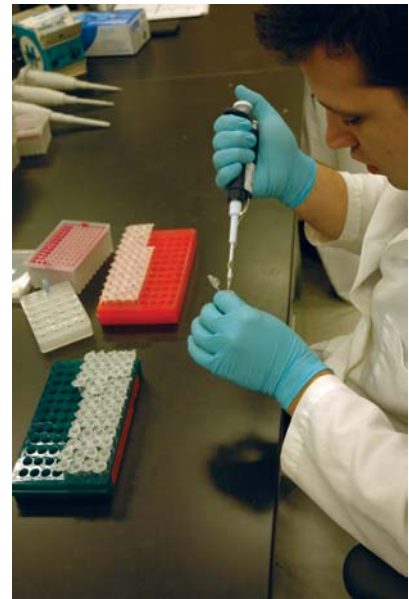
National Wetlands Research Center