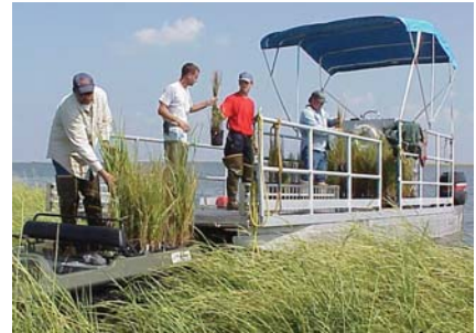
Natural Resources Conservation Service

with numerous techniques for propagating, producing, managing and establishing a variety of plants for application in diverse coastal habitats," says Fine. "The PMC is devising methodologies to increase the success of planting for coastal restoration." WM