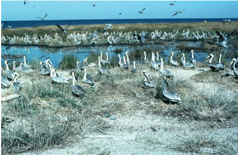
Thanks to habitat restoration projects in coastal Louisiana, the brown pelican is no longer on the U.S. Fish and Wildlife Service's endangered species list.