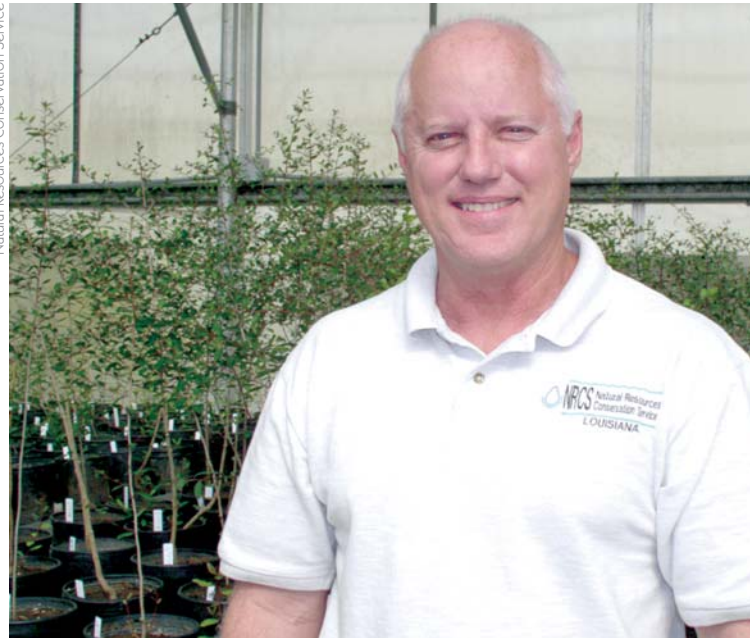
Natural Resources Conservation Service

Fine: We don't have any choice but to look ahead because it takes so long for a plant strain to prove itself — literally evaluating hundreds of plants over time in the case of a fully proven species or cultivar. Sea-level rise is a good example. We're searching for plants adaptable to rising sea levels and greater water depths now, even though its full effects probably won't be felt for some time.