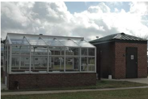
National Wetlands Research Center