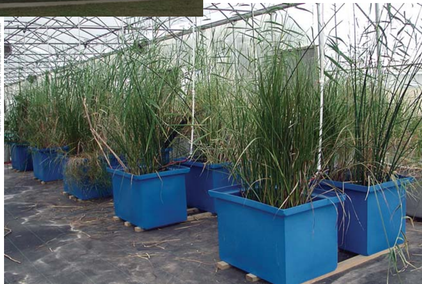
Top: Research in the labs and greenhouses at NWRC not only helps Louisiana fight wetlands loss, but also contributes to understanding the complexities of wetland ecosystems worldwide.