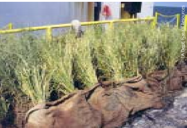
LA Dept. Natural Resources

stake, the quest for optimal plants and the best planting techniques is urgent. “Changes happen quickly in the wetlands,” Materne says, “and we’re helping plants keep pace. Drawing on the Ag Center’s decades of agronomic experience, we’re developing plants that will become the key element in coastal restoration.” WM