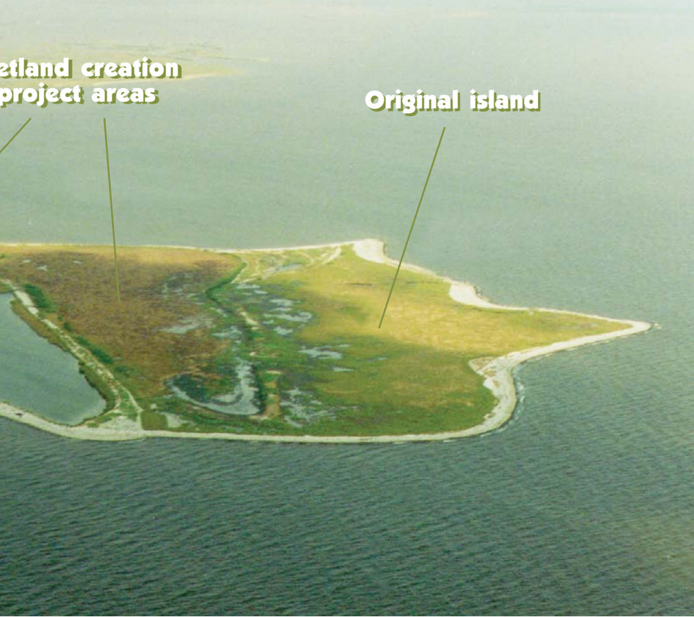
LA Dept. Natural Resources