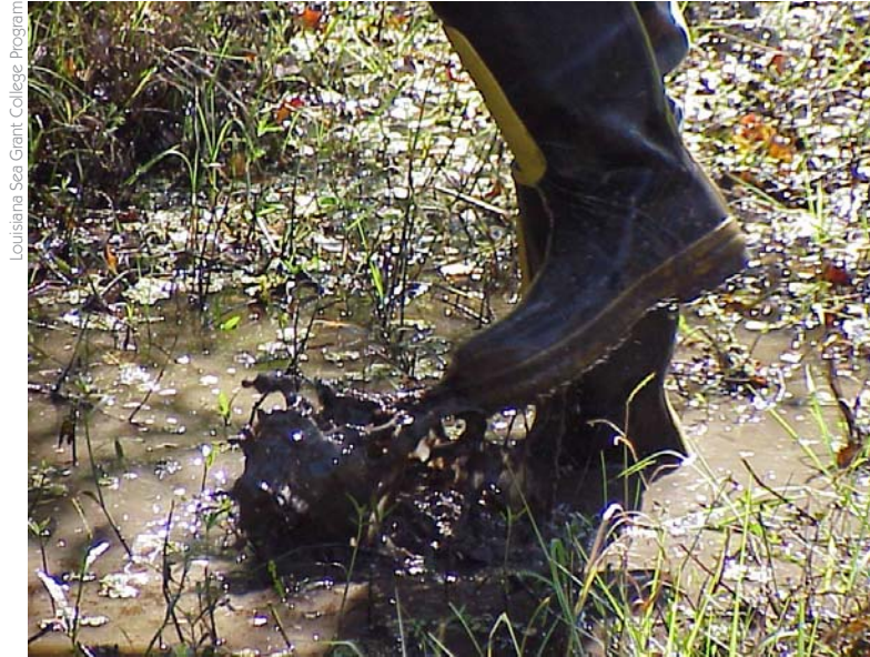
The unconsolidated soil of Louisiana’s wetlands can feel bottomless — in many places one can sink chest-deep in mud before there is enough solidity underfoot to arrest the plunge. The difficulty of establishing seedlings in such conditions spurs scientists to devise other planting methods.

Having done his share of digging in knee-deep water, Ron Boustany went back to the lab to search for other planting methods. In a recent study he grew submersed aquatic plant seedlings on biodegradable mats in a greenhouse. He then transplanted the seedlings