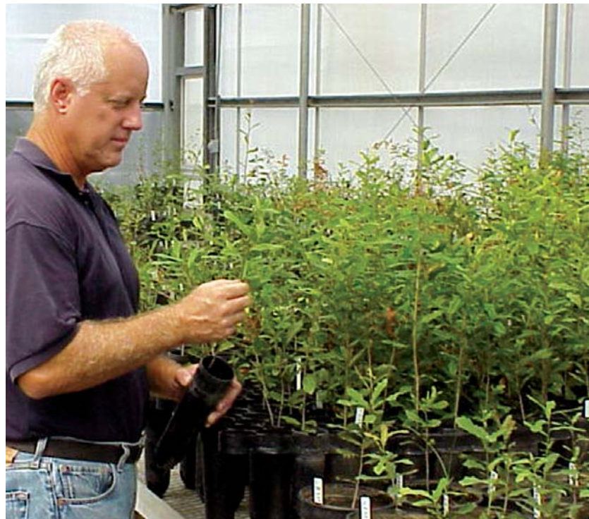
Scientists at the NRCS Plant Materials Center test strains of native species that are particularly adaptive to changing conditions in the wetlands. Only after careful, thorough testing is a superior strain identified and released as a proven performer.