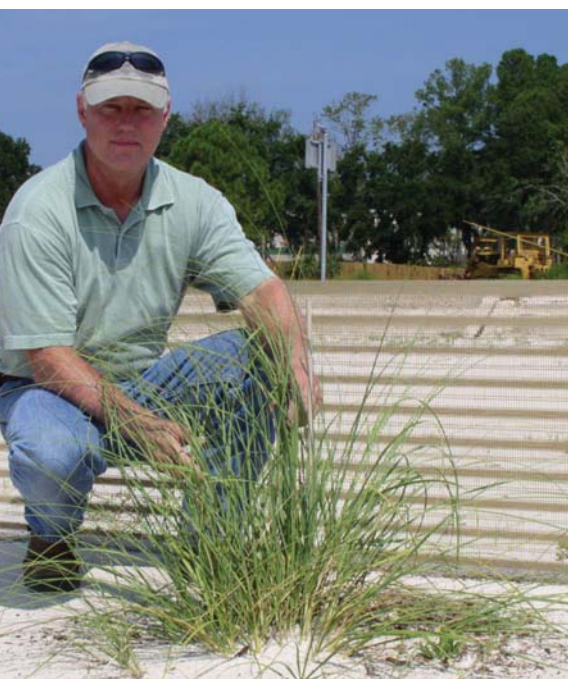
Natural Resources Conservation Service

Under Fine's leadership, the Plant Materials Center has become recognized for its botanical contributions to protecting and restoring Louisiana's wetlands.