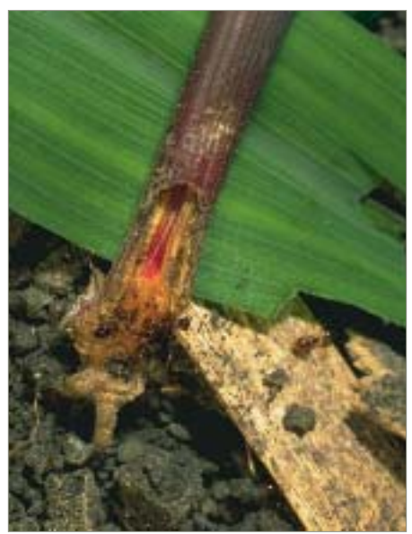
Red imported fire ants are notoriously difficult to eradicate. In Texas, county extension agent Glenn Avriett, left, treats a mound with the insecticide acephate. Ants can damage crops like corn, right, but most pesticide treatments would be undertaken to protect farmworkers, agricultural and electrical equipment, and irrigation systems.

less the probability of success for the first 5-year period program times the costs for the second. The expected benefits are equal to the probability of success for the first period times the total benefits plus the probability of failure for the first period times the probability of success for the second times the benefits. The probability of success during the second 5-year funding period is unknown. Consequently, the cost/benefit analysis estimates the probability of success that is needed for the expected benefits to be equal to the expected costs (table 4).