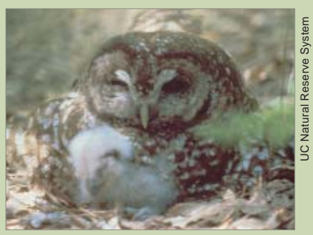
Spotted owl chick

Red imported fire ants disrupt ecosystems and endanger wildlife by preying on other insects; eating mammal, repitilian and bird newborns, and softshelled eggs: destroving habitat: and reducing food sources. The following endangered species could be at even greater risk if the ants become widely established in California.