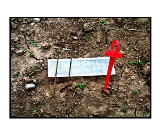
Metal wire staple left. Plastic staple right. Used to secure covering material.

Planting sites exposed to winds, should have Field Tunnels oriented parallel to the prevailing winds. Sites protected from wind should be oriented in a north-south direction to maximize sun exposure to plants. Two types of staples are available for anchoring Field Tunnel cover material. Plastic staples are easier to install in soft soils. Plastic staples are more expensive and may be reused for many years. Metal staples are easier to install in firm soils using a hammer and usually last about 2 to 3 years. They tend to accumulate rust scale