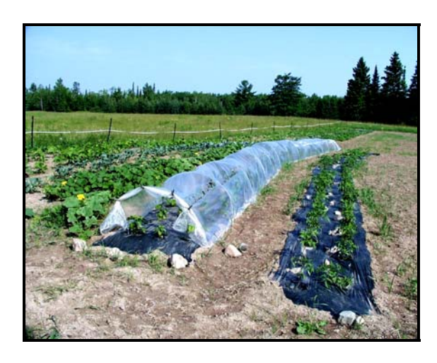
Clear slitted plastic Field Tunnel supported by wire hoops.