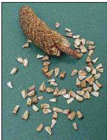
Tony Bush Rose Lake Plant Materials Center East Lansing, Michigan

using firm, healthy rhizomes cut into 2- to 4-inch sections. Plant sections in rich soil 4 - 6 inches deep and 1 foot apart. Separating individual sprigs from clumped plants is an alternative to using rhizomes. These should also be transplanted at 1-foot spacings.