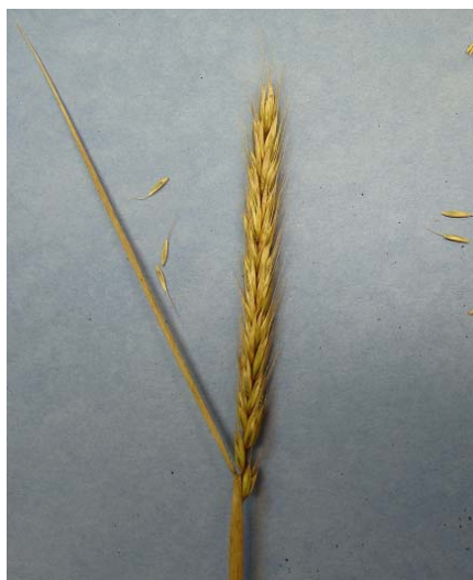
Spike erect, 3 to 8 in long, sometimes partially enclosed in flag leaf.

Rose Lake Plant Materials Center 7472 Stoll Road E. Lansing, MI 48823 517/641-6300