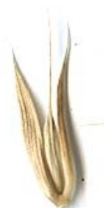
Grain kernel with awn between two glumes.

Riverbank wildrye prefers moist soils and is found in stream borders, alluvial flats and meadows. It also does well in clay soils. Riverbank wildrye is shade tolerant, but prefers full sun.