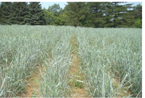
Icy Blue Germplasm Canada Wildrye