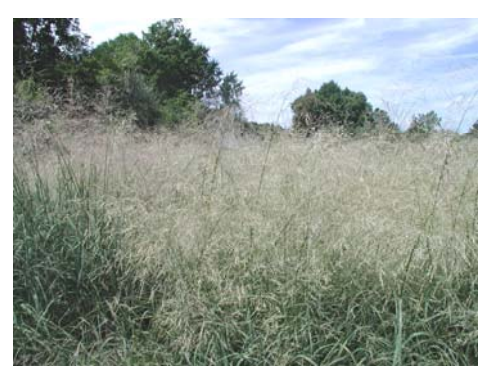
Koch Germplasm Prairie Sandreed