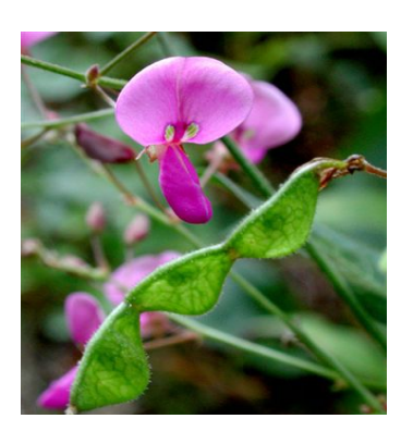
Grant Germplasm Panicledleaf Tick-Trefoil