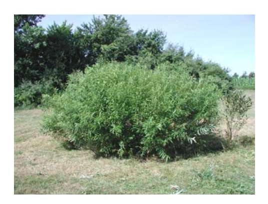
Riverbend Germplasm Silky Willow