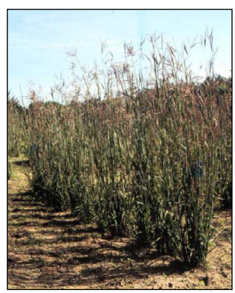
Big bluestem forage study