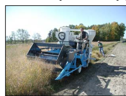
Harvesting Southlow Michigan Germplasm switchgrass