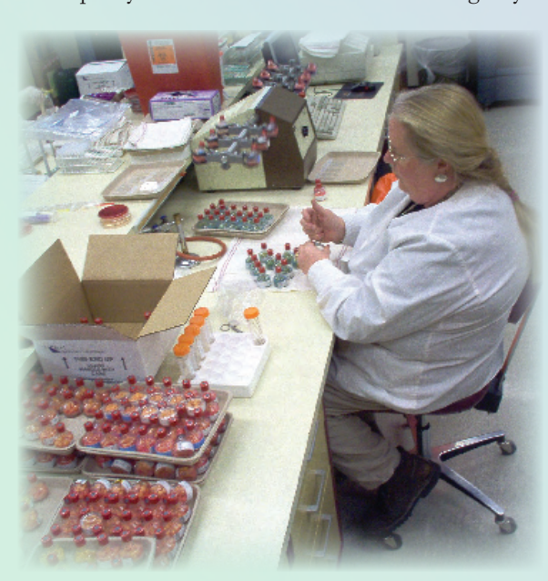
Purdue University Animal Disease Diagnostic Laboratory, West Lafayette, IN

A "train the trainer" program has been developed by NVSL and implemented to increase the number of laboratories with personnel trained to conduct the assays for diagnosing AI, END, CSF, and FMD. This program not only has increased the number of laboratory personnel prepared to respond to a national animal-health emergency but has also provided the United States with a cadre of trainers available to teach others when needed. The successful implementation of this program is a significant step for the NAHLN in achieving its goals of sufficient diagnostic capability and capacity to address an animal-health emergency.