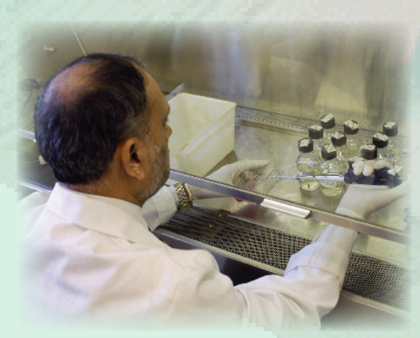
Minnesota Veterinary Diagnostic Laboratory, St. Paul, MN

The State/university laboratories in the NAHLN perform routine diagnostic tests for endemic animal diseases as well as targeted surveillance and response testing for foreign animal diseases. State/university laboratories also participate in the development of new assay methodologies.