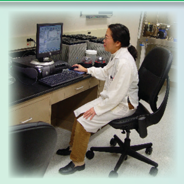
Diagnostic Center of Population and Animal Health, Lansing, MI

support of routine and emergency animal-disease diagnosis and official responses to bioterrorism events; standardized, rapid diagnostic techniques used at the State, regional, and national levels; secure systems for communication, issuance of alerts, and reporting; and modern equipment and experienced personnel.