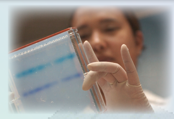
Ohio Department of Agriculture, Reynoldsburg, OH