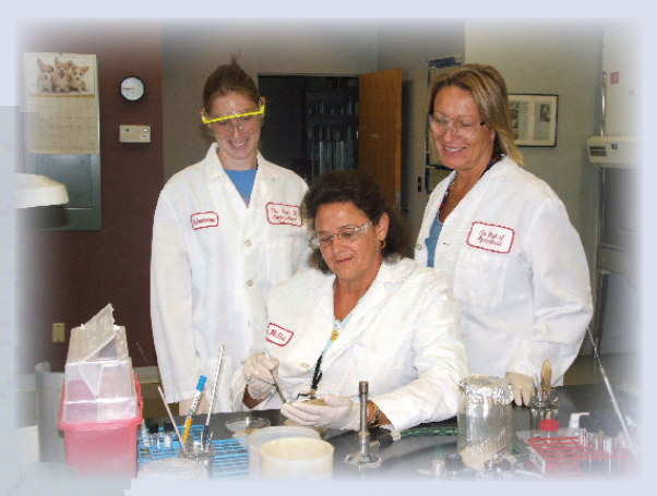
I Kissimmee Diagnostic Laboratory, Kissimmee, FL

Key elements of the NAHLN system include increased and more flexible capacity for laboratory