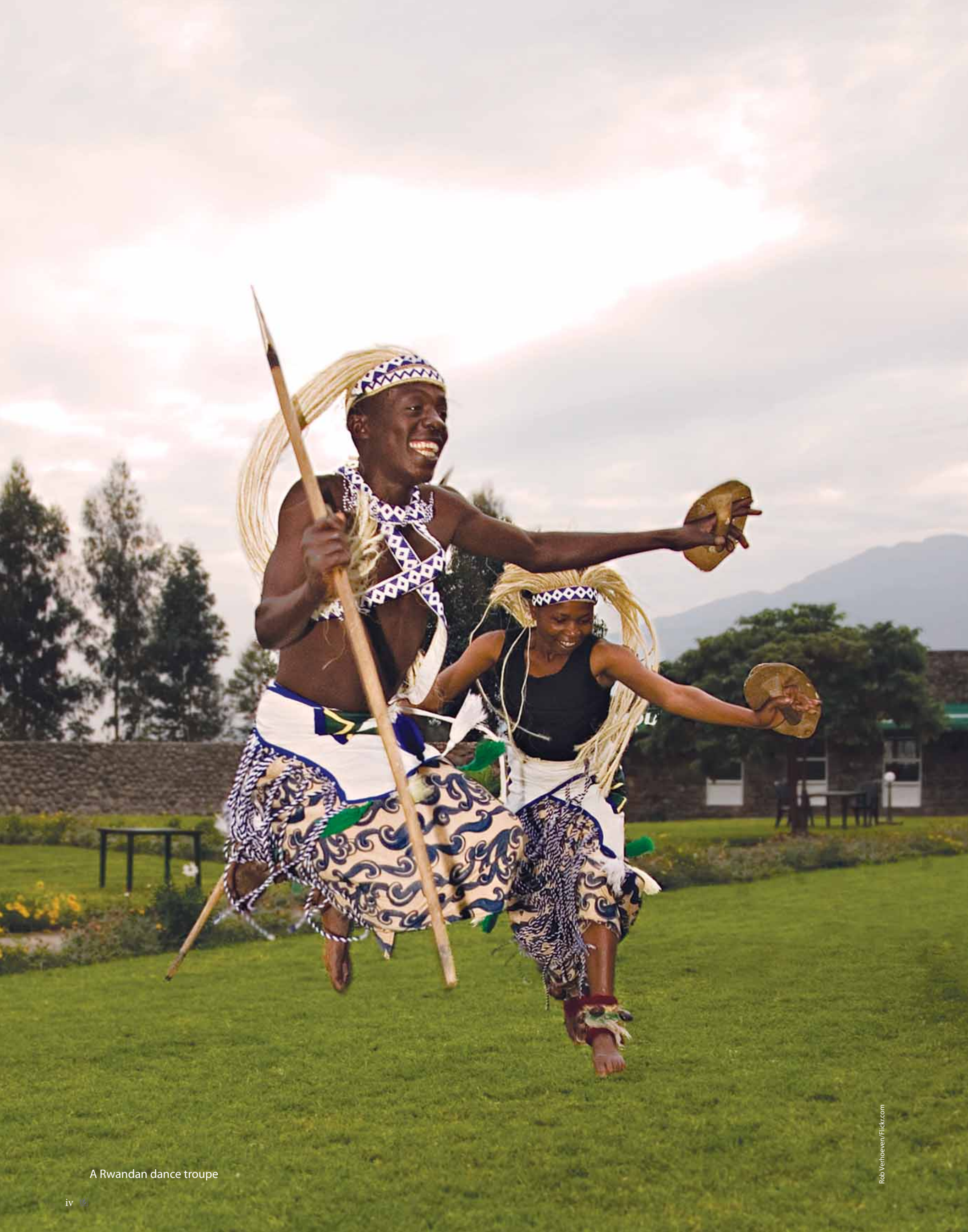
A Rwandan dance troupe