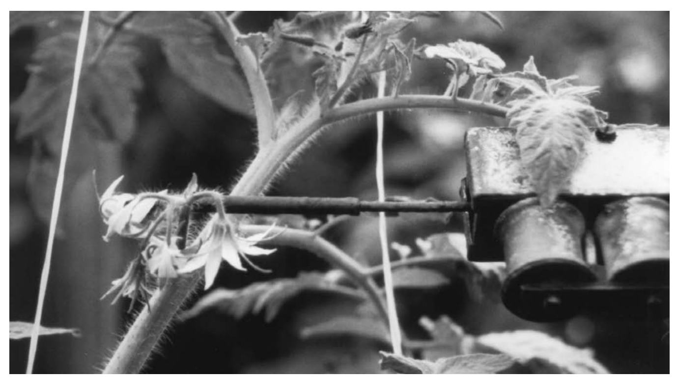
Touch the pollinator wand to the upper side of each pedicel (flower stem). Do not touch individual flowers.

In a hobby greenhouse, the expense of a pollinator is probably not necessary. You can purchase an electric polli-