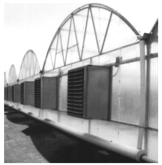
Exhaust fans are essential to remove heat even in the winter.

An important point: Any time dissolved solids or EC are measured in a solution, it is very important to know the dissolved solids or EC of the water source used to make the solution (it cannot be assumed to be 0). There may be sodium or some other dissolved element in your tap water that can lead to false readings when you measure your nutrient solution. Subtract the water source EC or dissolved solids measurement from that of the nutrient solution to find the true value caused by fertilizer. This is the number to compare to charts to decide if the correct amount of fertilizer is in solution.