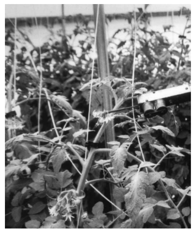
Pollination is best accomplished with an electric pollinator.

As you prune the plant to one main stem, wrap it around the support string. You can prune and wrap in one operation, doing both to a plant before moving on to the next plant. Always wrap in the same direction—if you start