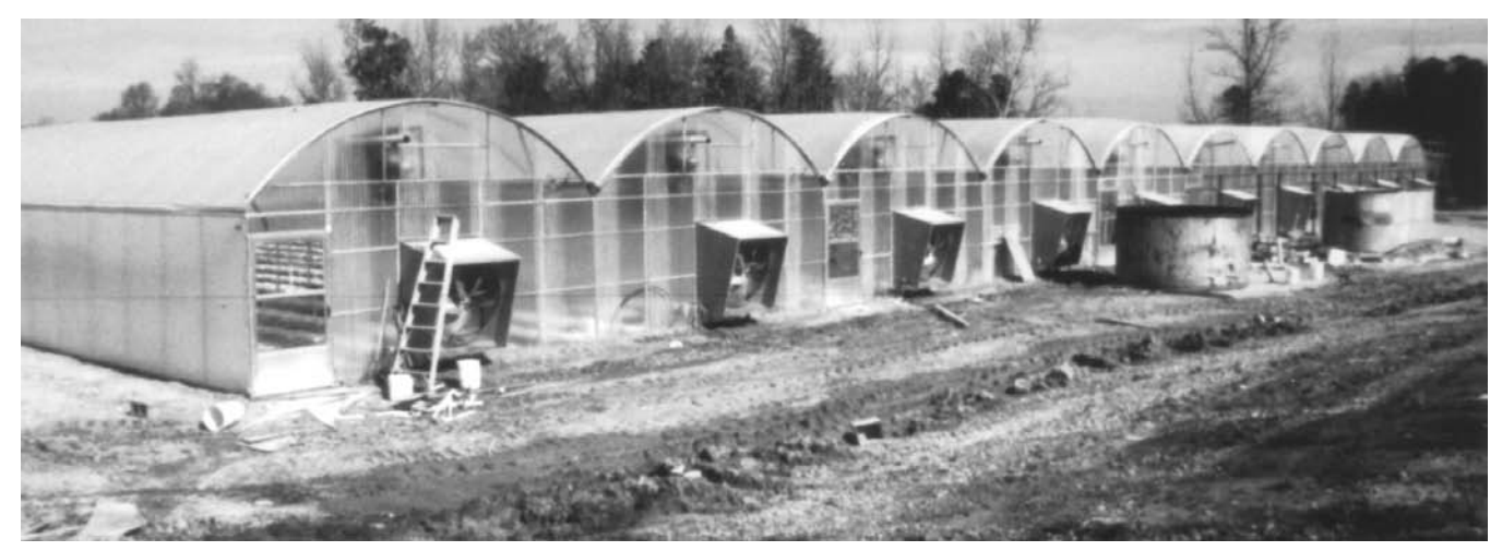
Shown are 10 greenhouse bays in a gutter-connected range (1/2 acre).

To determine how much acid to add to a bulk or concentrate tank of nutrient solution, take 1 gallon of solution and add 1 ml of acid at a time until the pH of the nutrient solution is within the range stated. Then, multiply the amount added to 1 gallon times the number of gallons in the tank. If