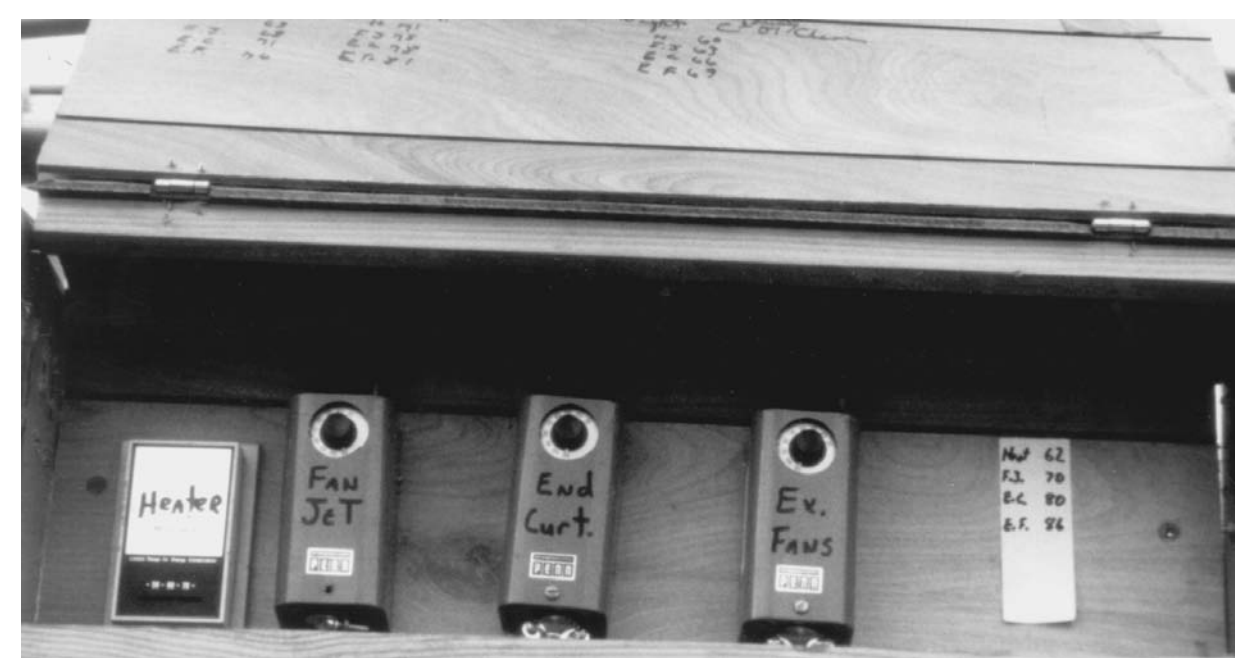
Locating thermostats in a box will avoid direct sun on them. An aspirated box is best.