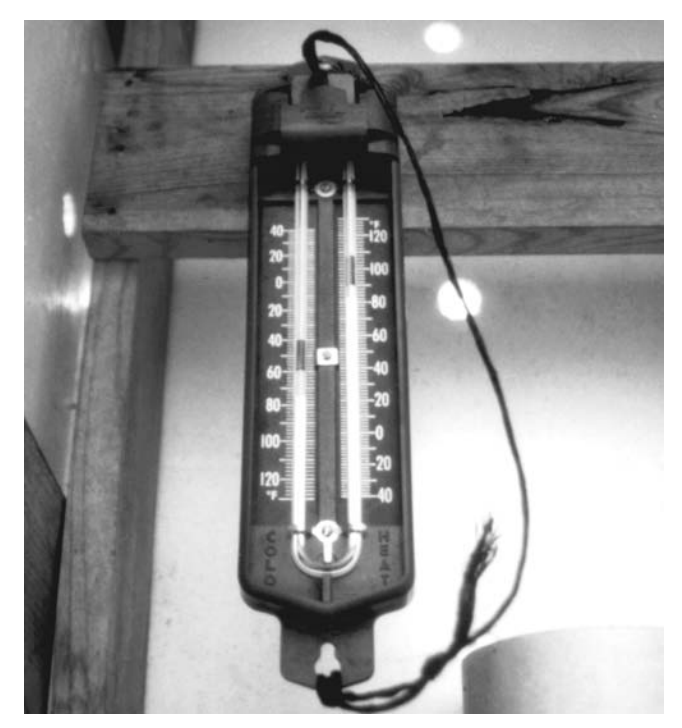
Use a thermometer that records the high and low temperatures.

The most common product is Kool-Ray, from Continental Products Co. This material is diluted with water; use 2 to 20 parts water for 1 part Kool-Ray, depending on the amount of shading desired. It is better to apply a thin coat early in the season (using more water) and then darken it later if needed. It is much easier to darken the shade than to lighten it once it has been applied. The ratio of 1 part Kool-Ray to 7 or 8 parts water has worked well in Mississippi. About 10 gallons of dilute solution covers a standard greenhouse (24 by 96 feet). It is best to apply it as small droplets and try to avoid streaking. Apply it during