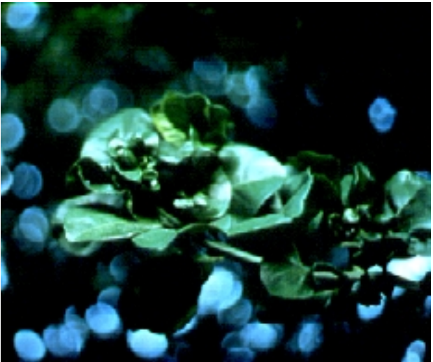
Figure 6 —“Bunchy top” in citrus.

Economic losses exceed $3.5 million a year in Grenada and $125 million a year in Trinidad and Tobago.