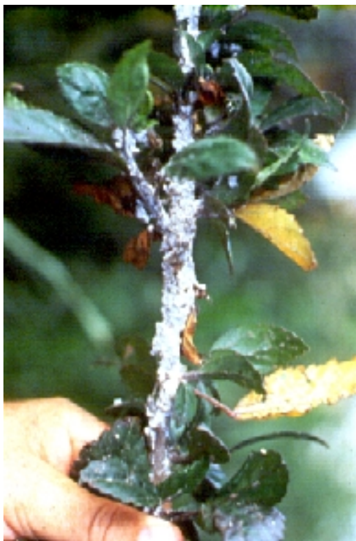
Figure 2 —Infested hibiscus twig (above) and hibiscus shrub (below).