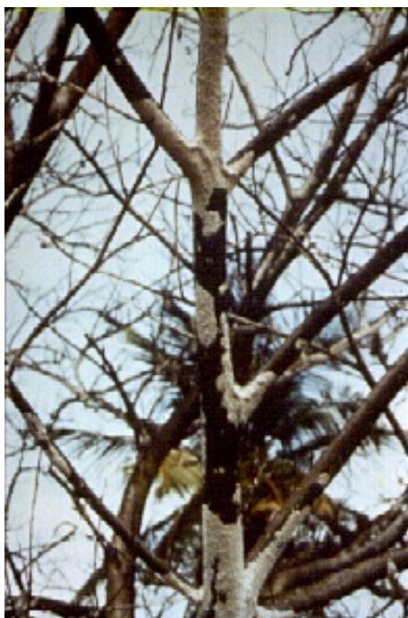
Figure 1 —Saman tree killed by heavy PHM infestation. White PHM egg masses cover the trunk and branches.

The pink hibiscus mealybug (PHM)— Maconellicoccus hirsutus (Green)—is a serious new threat to U.S. agriculture. It attacks more than 200 plants (fig. 1), including beans, chrysanthemum, citrus, coconut, coffee, cotton, corn, croton, cucumber, grape, guava, hibiscus, peanuts, pumpkin, rose, and mulberry. This pest is presently established in central and northern Africa, India, Pakistan, northern Australia, and southeastern Asia. But it has recently arrived in tropical areas in the Western Hemisphere.