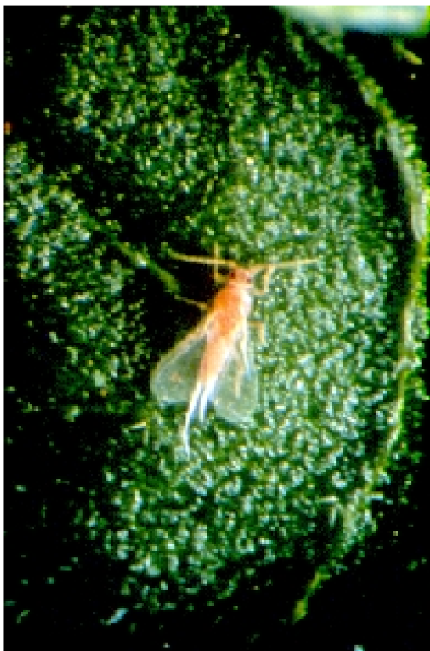
Figure 5 —Adult male.

Smaller than the female mealybugs, adult males are reddish brown and have one pair of wings and two long wax caudal filaments (fig. 5). The males have nonfunctional mouthparts. Males do not feed and live for only a few days. Unmated females produce a sex pheromone (an attractant scent) that lures PHM males for mating.