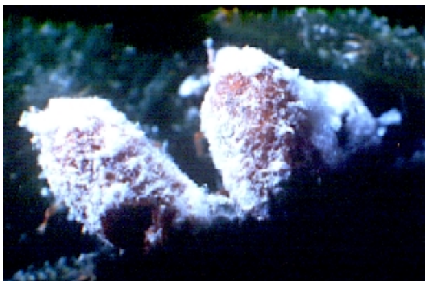
Figure 8 —PHM mummies (one with exit hole of parasite).