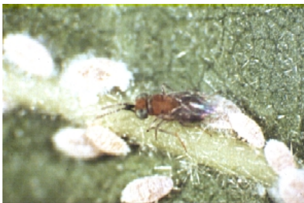
Figure 7 —The parasite Anagyrus kamali , adult female (above) and adult male (below).