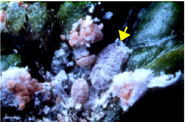
Figure 3 —Adult female (arrow) and immatures.

The adult female (fig. 3) is about 3 mm long and wingless with white, flocculent wax covering the dorsal surface. It has two short, inconspicuous caudal filaments and no lateral wax filaments. The female's body and body fluid are both reddish. The female secretes a white cottonlike egg mass, irregular in shape, and lays from 300 to 600 pink eggs inside (fig. 4). First-instar nymphs, or pink crawlers, emerge from the eggs. When the egg mass is teased open, the pink eggs and crawlers are exposed and easily seen. In tropical climates, it takes about 30 days to complete 1 generation.