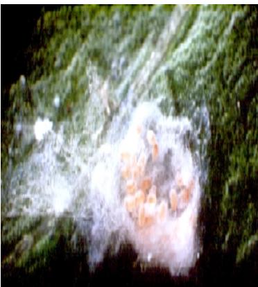
Figure 4 — Pink eggs in an egg mass.