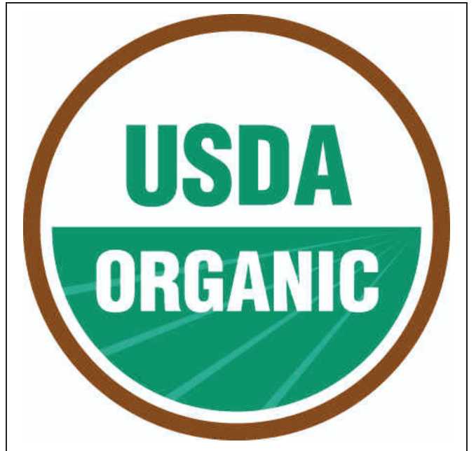
Figure 3 – The USDA organic seal

The European Commission recently adopted a proposal for new regulations on organic production. The new rules, effective January 1, 2007, are meant to be easier to understand for both producers and consumers and will be slightly flexible for the different regions in the European Union (EU). Organic products in the EU must contain at least 95% organic ingredients. Imported organic products must comply with EU standards or the country of origin must have equivalent guarantees. The United States also accepts products from countries that have equivalent guarantees, such as the EU.