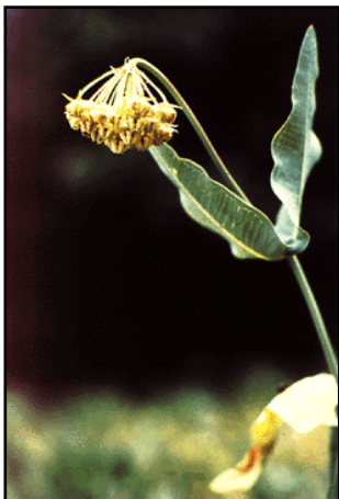
Mead's milkweed is a perennial herb that is found predominately in virgin tallgrass prairie.

The Manhattan PMC in Kansas is reintroducing Mead's milkweed ( Asclepias meadii ) into the tallgrass prairie communities where it is a component of the native landscape. In cooperation with the Kansas Biological Survey, the Manhattan PMC is conducting a propagation study on Mead's milkweed.