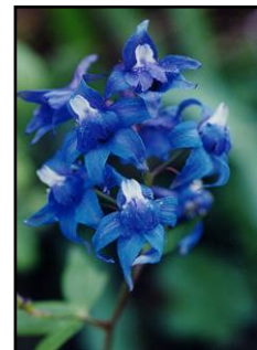
Baker’s larkspur ( Delphinium bakeri ) is one of California’s endangered plants that will be included in the Lockeford PMC project.

The project, in cooperation with the Agricultural Research Service and the USFWS, will collect endangered plants throughout California, propagate them, develop a foundation seed source, study methods of re-establishment, and release plants for commercial propagation and eventual use in revegetation projects.