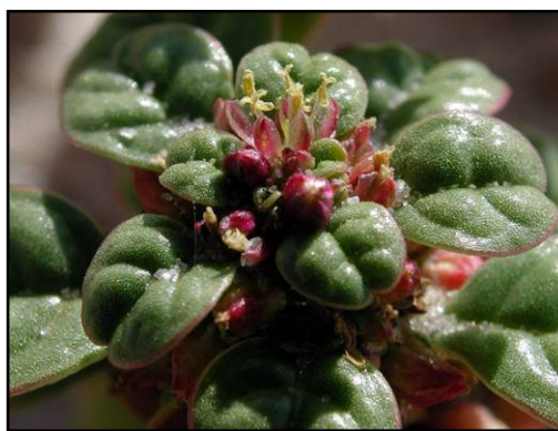
Seabeach Amaranth is one of New Jersey's threatened plants.

The Cape May PMC in New Jersey has provided technical assistance to the USFWS and the U.S. Army Corps of Engineers in developing technologies to expand seabeach amaranth ( Amaranthus pumilus ), which is listed federally as threatened and by the State of New Jersey as endangered.