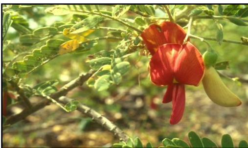
Ohai is a prostrate shrub to a small tree that produces amazing large red pea-like flowers.

“Threatened” is defined as any species which is likely to become endangered within the foreseeable future throughout all or a significant portion of its habitat range. “Endangered” is any species which is in danger of extinction within the foreseeable future throughout all or a significant portion of its range.