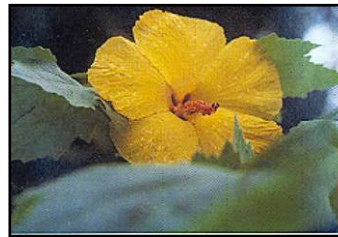
Mao hau hele in flower

Hawaii has more plant species listed as threatened and endangered than any other state. Most of Hawaii’s endangered species have been adversely affected by invasive plants and animals. The Hoolehua Plant Materials Center (PMC) is finding ways to propagate certain T&E species such as ohai ( Sesbania tomentosa ). Ohai occurs on all the