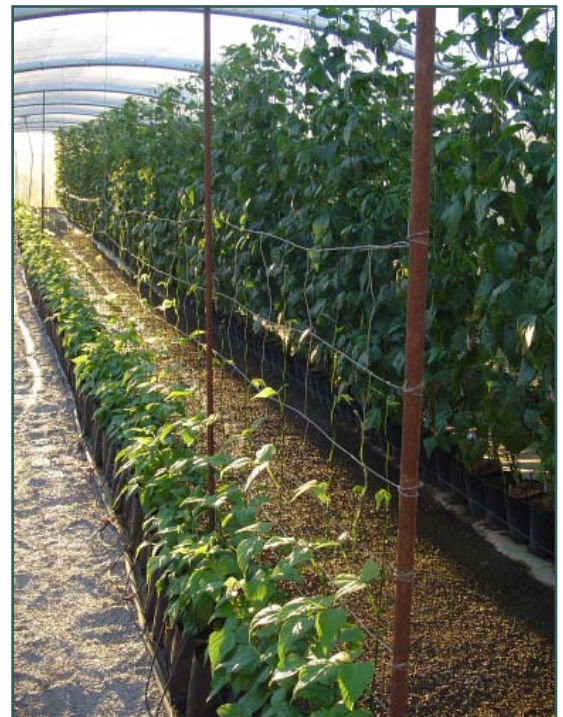
Rows of greenbean beanstalks.

Sustainable nursery practices can increase plant marketability and reduce a nursery's impact on the environment. This publication focuses on the sustainable production of woody and herbaceous nursery plants, both in containers and in the field. It is not a primer for inexperienced growers, but a complementary source of information that concentrates on sustainable production techniques. Topics covered include integrated pest management, weed control and alternative fertilizers. The publication also introduces business management practices.