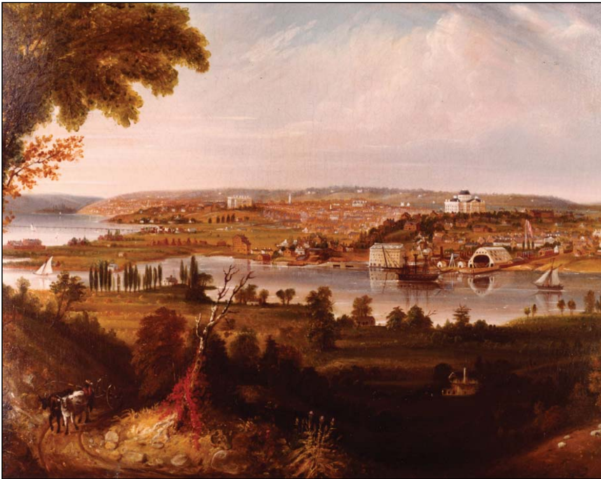
"City of Washington From Beyond the Navy Yard" - Oil painting by George Cooke, 1833. This painting is part of the Anacostia Community Museum's 40 th Anniversary Exhibition, "East of The River: Continuity and Change."

We are conducting a performance audit of travel oversight. The objectives of this audit are to assess whether (1) policies and procedures related to travel expenditures are adequate and in compliance with applicable laws and regulations; (2) key controls for managing travel are operating properly in the units; (3) Smithsonian executives, Regents, and staff are traveling for authorized purposes and for reasonable amounts; and (4) cardholders are paying their travel card obligations in a timely manner. The audit is covering travel for the period FY 2006 through the first quarter of FY 2008.