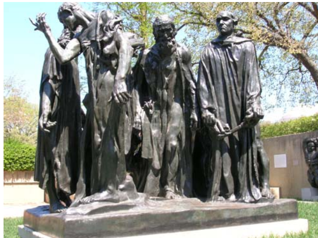
August Rodin, French, 1840-1917. The Burghers of Calais , (1884-89,) cast 1953-59. Gift of Joseph H. Hirschhorn, 1966. On display in the Hirschhorn Sculpture Garden.

To this end, during the past semiannual period we completed 5 audits and reviews; worked with management to close 23 recommendations; provided formal oversight of the Institution's annual financial statement audit, and completed substantial work on ongoing audits.