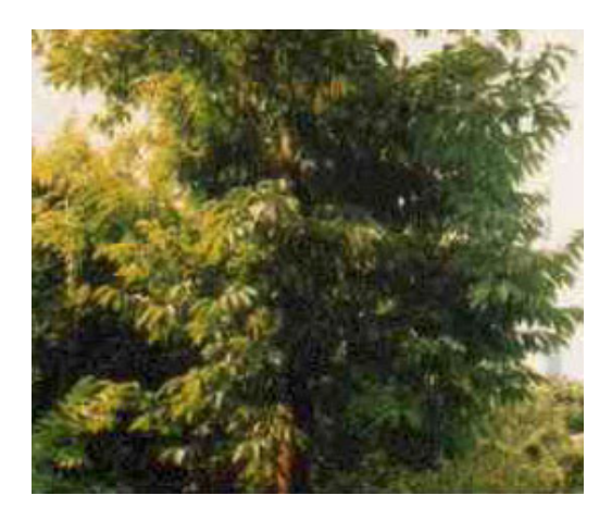
Fig. 2. A mature tree of Artocarpus lakoocha .