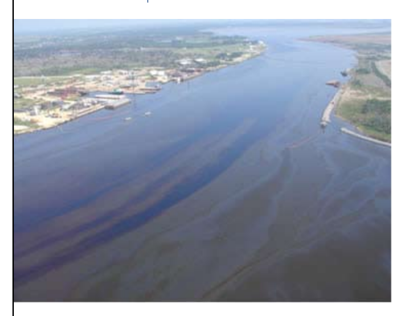
Aerial view of an oil spill on the Calcasieu River in southwest Louisiana on June 25, 2006.

The WFO issued more than 300 HAZMAT Spot Forecasts throughout this period to support hazardous incident clean-up and recovery. For more information about these events, visit the WFO Lake Charles Website at www.srh.noaa.gov/lch/.