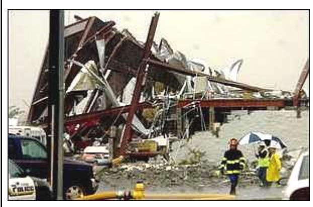
Fun Zone Skating Rink and day care center destroyed by an F2 tornado in Montgomery, Ala.