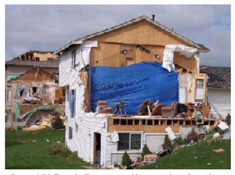
Rogers, MN, Tornado. Damage caused by a tornado on September 16, 2006.

A number of enhancements currently planned for NWS WSR-88Ds might have helped