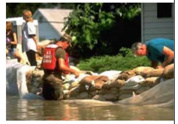
Flood Safety is just one focus for the week. Other themes include determining Flood Risk and Insurance, Turn Around Don't Drown™, The Advanced Hydrologic Prediction Service, and Flooding and Related Phenomena such as snowmelt, ice jams, debris flooding, inland tropical flooding and more.