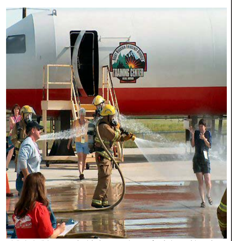
A "victim" is sprayed with decontaminant after being subjected to a biological agent released onboard a plane during Operation Last Chance in Helena, MT.

"A cold front and weak shortwave approached the area by late afternoon and convection developed over the Elkhorn Mountains by 2 p.m. Around 3 p.m. an initially weak cell moved into the valley and intensified as it moved over the incident location around 3:15