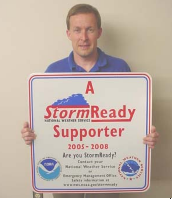
NWS now offers the option of s StormReady Supporter sign as well as the community and county signs.

Huntsville staff members plan on continuing the StormReady Supporter project throughout their 14 counties, specifically targeting large factories, universities and other significant partners, including media, within each of the counties. *