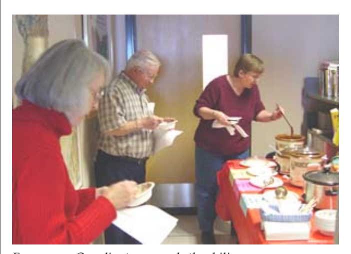
Emergency Coordinators sample the chili.

Have you ever dreamed of combining the cold of winter with the heat of the southwest? WFO Pocatello, ID, used the unusual duo to draw media, Homeland Security Staff, Natural Resources Conservation Service and EM managers to its second annual Groundhog Day Chili Cook-Off Contest and Hydrologic Outlook Briefing on February 2.