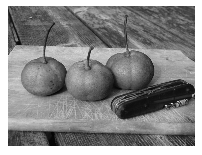
Fig. 7. Shipova ( Sorbopyrus auricularis ) fruits' sweet, perfumed flavor and chewy texture reflect their hybrid origin from European pear ( Pyrus communis ) and, probably, common whitebeam ( Sorbus aria ).

The final fruit highlighted is so-called hardy kiwifruit [Actinidia arguta (Siebold & Zucc.) Planch. ex Miq., Actinidiaceae, Zones 4–9], a cold hardy cousin of the fuzzy market kiwi (Actinidia deliciosa, Actinidiaceae, Zones 7–9). Although A. arguta is the most commercially viable of the "other" kiwis, A. kolomikta (Zones 3–7) also has some potential, its main limitation, as compared with A. arguta, being fruits that are smaller and that drop too readily when ripe. All Actinidia are vigorous vines bearing fruit in a similar manner as grapes. Commercial limitations of hardy kiwifruits are the same as for market kiwifruits, that is, separate male pollinator plants are needed as well as trellising, pruning more than once per year, and perfectly drained soil.