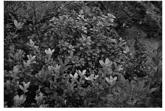
Fig. 2. Lingonberry ( Vaccinium vitis-idaea ) is a low growing evergreen shrub often bearing two crops each season of pea-sized, red berries that are usually cooked but also taste good fresh.

Gumi ( Elaeagnus multiflora Thunb., Elaeagnaceae, Zones 4–9) is a self-fruitful shrub whose fruit (Fig. 4), the size of a small cherry and with a refreshing, sprightly flavor, is eaten in Japan. It is extremely rich in