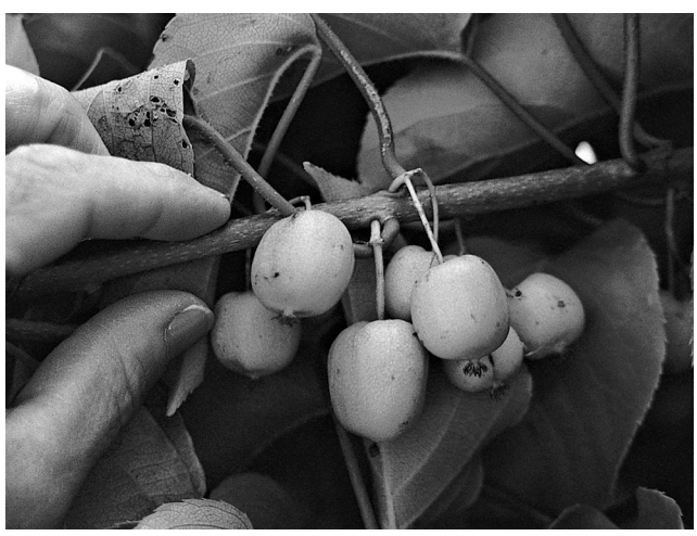
Fig. 8. Hardy kiwifruit ( Actinidia arguta ) fruits ripen in late summer and early fall with smooth, edible skin and flavor similar to, but generally sweeter and more aromatic, than market kiwifruit ( Actinidia deliciosa ).