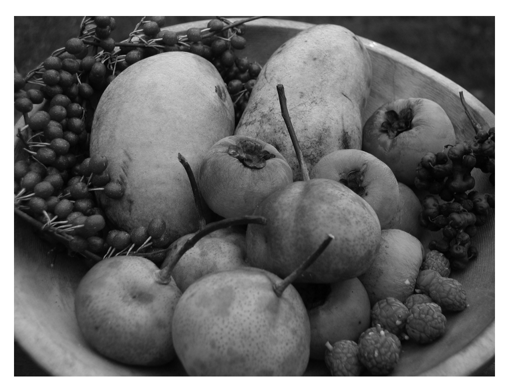
Fig. 9. This bowlful of uncommon fruits that ripen in autumn show some of the possibilities that exist in uncommon fruits. All have good flavor and can generally be grown without pesticide sprays. Pictured are autumn olive ( Elaeagnus umbellata ), pawpaw ( Asimina triloba ), shipova ( Sorbopyrus auricularis ), che ( Cudrania tricuspidata ), and raisin tree ( Hovenia dulcis ).

The fruits mentioned represent but a portion of the fruits under study. Others, such as Hovenia dulcis (Rhamnaceae), Cudrania tricuspidata (Moraceae) and Morus nigra (Moraceae) are suitable for home, but not commercial, production. For more complete discussions of the history, the cultivation, the harvest, and varieties of all these uncommon fruits, I refer you to my book on the subject, Uncommon Fruits for Every Garden (Timber Press, 2004).