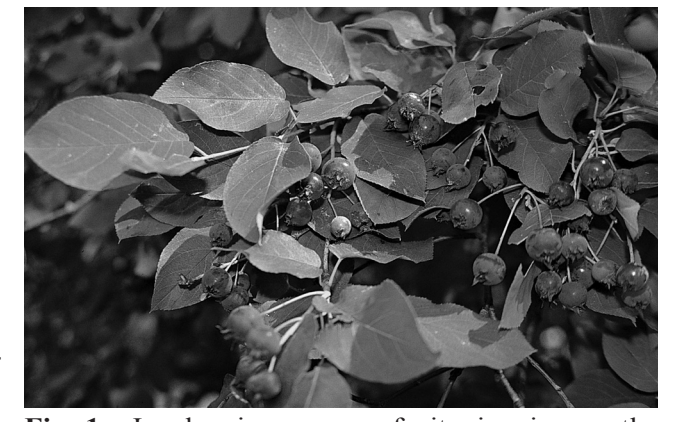
Fig. 1. Juneberries, a pome fruit, ripening on the branch of an unidentified species of Amelanchier , resemble blueberries but have a unique flavor that is sweet with a hint of almond.

Lingonberry is a low-growing, evergreen shrub that spreads by underground runners (Fig. 2). The plants are native throughout the northern regions of the world, although the species is separated into two botanical varieties each that differ in morphology and range. The larger of the two, Vaccinium vitis-idaea var. vitis-idaea , grows about two feet high, has 2.5 cmlong, pointed leaves; it is hardy to Zone 4 and native to lowlands of Europe and northern Asia. The more diminutive variety, Vaccinium vitis-idaea var. minus , Ericaceae, stays under 20 cm and has commensurately smaller leaves, 0.8 \times 0.4 cm, oval, and rounded at