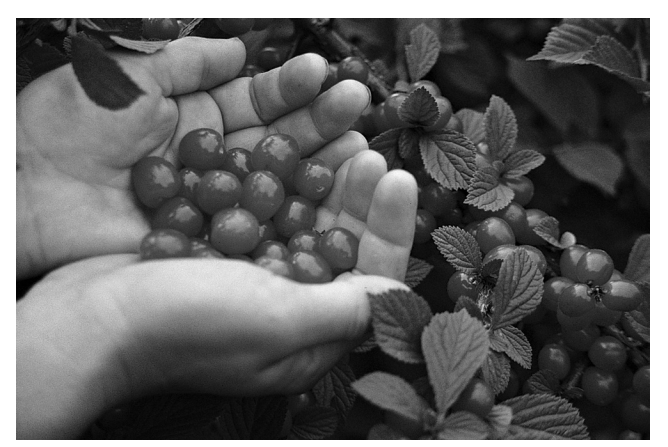
Fig. 5. With cross-pollination, fruit set of Nanking cherry ( Prunus tomentosa ) is very high, yielding red fruits about 1.6 cm across with flavor, depending on the clone, somewhere on the spectrum between that of common sweet and tart cherries.