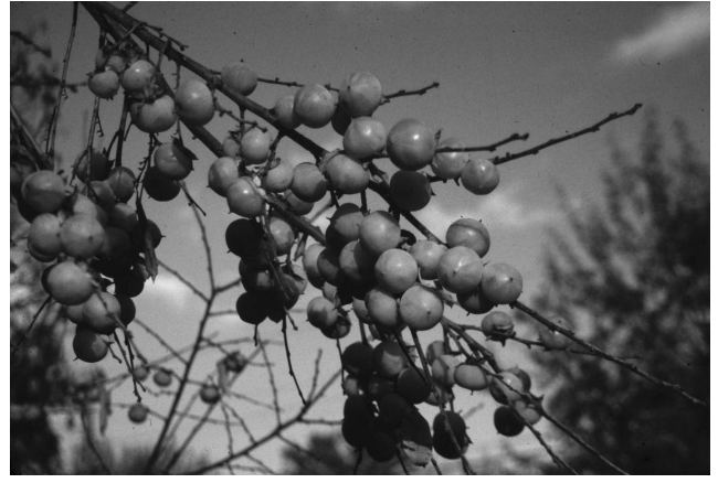
Fig. 3. Fruits of 'Szukis' American persimmon ( Diospyros virginiana ) cling to branches for a few weeks after leaf dehiscence; the orange fruits are soft and very sweet with a rich flavor.