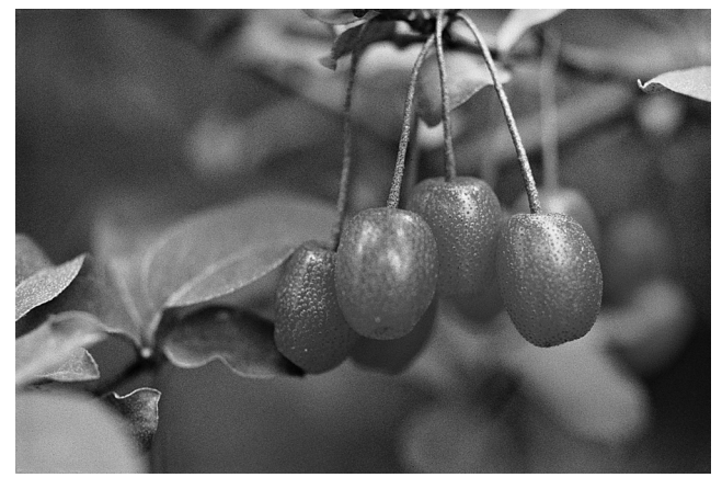
Fig. 4. Gumi ( Elaeagnus multiflora ) fruits are the size of small cherries, very juicy, and have a refreshing but somewhat tart flavor that could be improved by breeding.

The tree needs cross pollination but little else. Some research is needed into the effect of cluster or bunch thinning on fruit size and the development of nonsuckering rootstocks. Research is also needed into