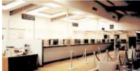
This photo shows a clear plastic barrier between employees and customers that can reduce occupational exposure to the general public.

Administrative Controls - Administrative controls include controlling employees' exposure by scheduling their work tasks in ways that minimize their exposure levels. Examples of administrative controls include: