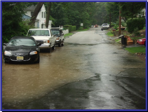
Installation of Best Management Practices devices will address stormwater runoff, as shown in Jefferson Township.