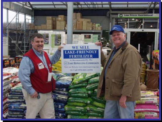
Stores around the Lake Hopatcong Watershed display signs to promote the sale of lake-friendly fertilizer.

Since its creation in 2001, the Lake Hopatcong Commission has partnered with the New Jersey Department of Environmental Protection, the four lakeshore towns and two counties in the watershed and the Commission's environmental consultant, to improve the lake's water quality.