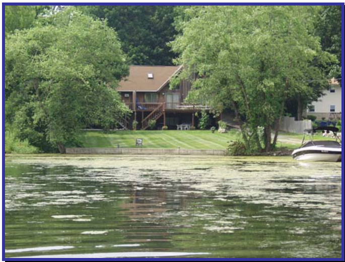
Innovative retrofits using iron-oxide sleeves to reduce the phosphorus load will be installed in catch basins alongside Ingram Cove in Hopatcong Borough to protect the fishery and recreational use of the lake.