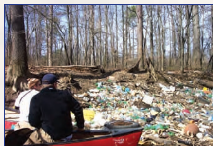
A project goal is to reduce floatable trash by 20 percent.

“The Fourche Creek float was an experience I never thought I would have in the heart of Little Rock. The ancient trees, the shade, the winding stream channels, and the flash of birds: green heron, great horned owl, and Mississippi kites. I would never have known about it had I not been involved with Audubon.”