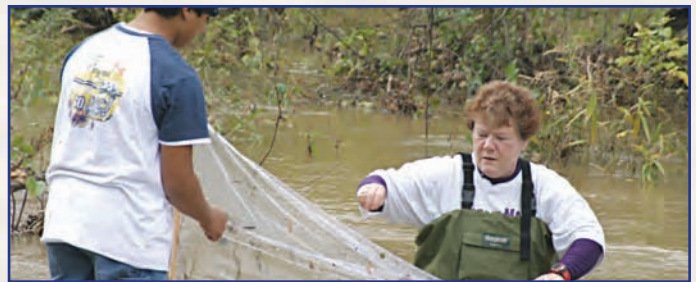
Students learn water quality monitoring techniques.