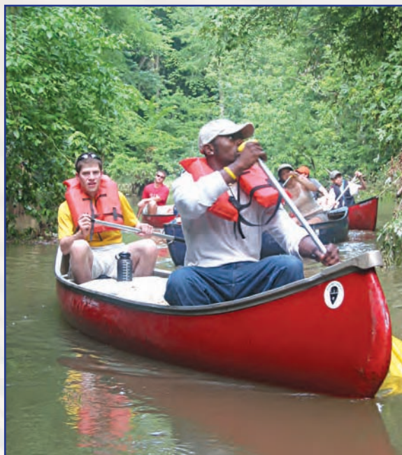
Interns learn about wetland and forest habitats.