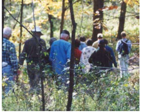
The Nature Conservancy

Invasive plants can affect your ability to enjoy natural areas, parks, and campgrounds. Hikers, cyclists, and horseback riders all enjoy well-maintained trails, and invasive plants can grow over trails to the point that the path cannot be followed or can be difficult to navigate through. Dried and dying knapweed plants catch in bicycle chains, slowing the rider and stirring up dust as they are dragged.