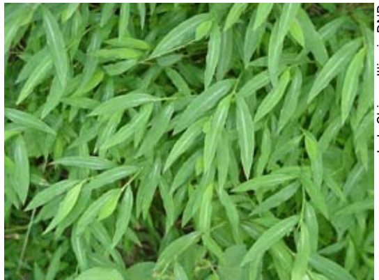
Jody Shimp, Illinois DNR

Japanese stiltgrass is an annual grass that thrives in forested areas with moist soils and along streambanks and ditches. It often makes its way into forests along trails or old logging roads and from there can rapidly spread into the forest understory, completely wiping out all other plants within just a few years. Stiltgrass has broad leaf blades that can be identified by the presence of a pale, silvery stripe of hairs along the middle of the leaf on the upper leaf surface. Japanese stiltgrass is abundant in the southern part of the Midwest region and is rapidly moving northward.