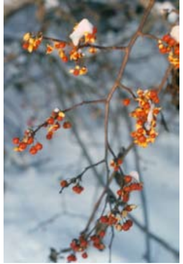
Eileen Jacquart, TNC

or killed by the vine, which constricts sap flow, weakens limbs and trunks making them more susceptible to wind and ice damage, and shades out leaves growing underneath it. Asian bittersweet is also able to hybridize with American bittersweet, altering the genetic make-up of the species and further reducing rare native populations.