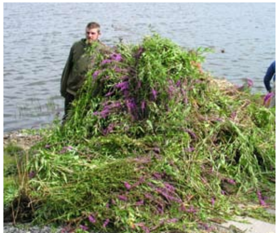
Purple loosestrife plants