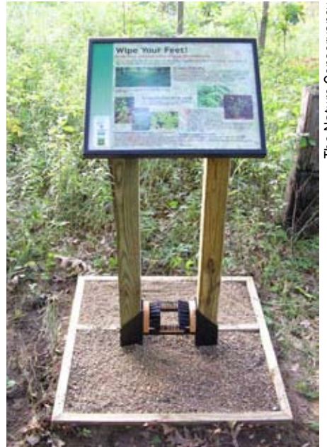
The Nature Conservancy