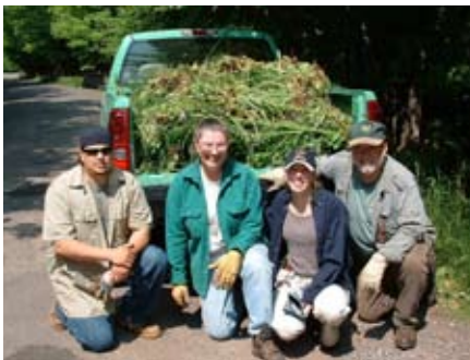
Hand-pulling invasive plants