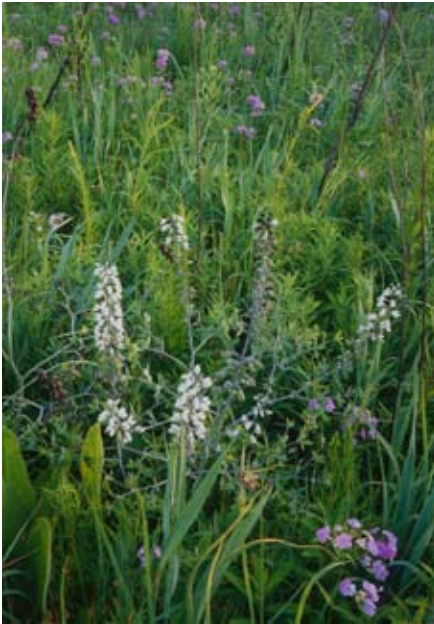
Native prairie plants

Natural scenic beauty sought by recreationalists is degraded by invasive plants, which often form single-species stands, displacing attractive native flowers. The annual trek to see spring wildflowers or hunt for mushrooms may be disappointing when none can be found in a sea of garlic mustard.