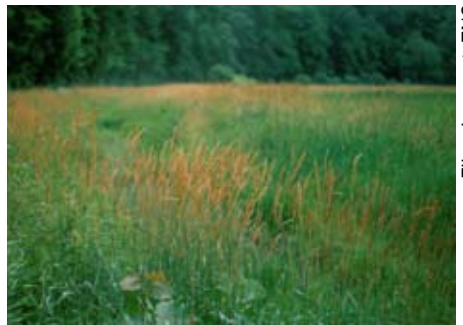
Ellen Jacquart, TNC

FACT: Many non-native species do not cause problems in the areas where they are introduced and can be important for agriculture, horticulture, medicine, or other uses. The species of concern are those that become invasive, taking over native ecosystems and crowding out native species. It is often difficult to know in advance if a new species that is introduced will become invasive, so great caution should be used when importing or planting new species.