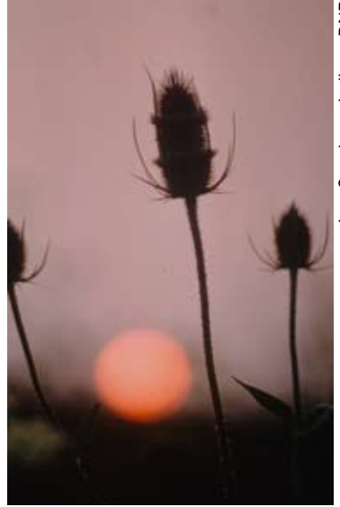
Lee Casebere, Indiana DNR

This species may have been introduced from Europe as early as the 1700's, yet its abundance in the Midwest has increased rapidly in the past 20-30 years. Its range is believed to have expanded along highway corridors, with seeds spread by mowing equipment. Cutleaf teasel is also commonly used in flower arrangements. When these arrangements are discarded or left behind in cemeteries, they can cause new infestations. Once established, cutleaf teasel can expand rapidly into prairies, excluding native vegetation. Teasel has a unique inflorescence that makes it readily identifiable when flowers or seed heads are present.