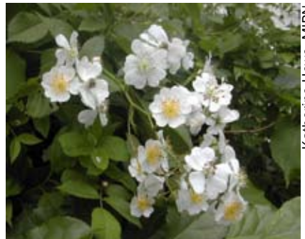
Katherine Howe, MIPN

natural areas. Multiflora rose is tolerant of a wide range of habitat conditions and grows aggressively once established. Multiflora rose can be distinguished from native roses by the presence of fringed stipules (small, green, leaf-like structures at the base of each leaf); stipules on native roses are not fringed.