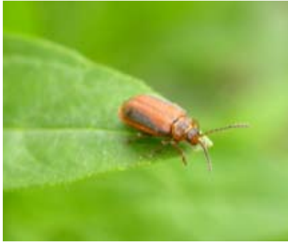
Scott Namestnik, JF New

FACT: There is no one miracle fix for controlling invasive plants. Relying on a single control method is unlikely to be successful. The best approach is an integrated management plan tailored to specific sites and species that includes a combination of methods appropriate to the situation, such as chemical control (herbicides), biological control (insects or pathogens), mechanical control (pulling or cutting), and prescribed burning.