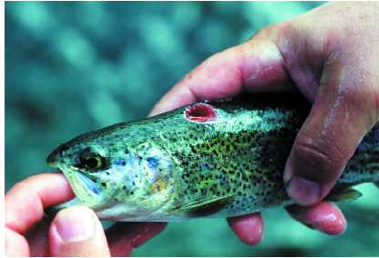
Farm-raised fish are an easy meal for double-crested cormorants and American white pelicans.

WS assists the aquaculture industry in meeting the challenge of managing the damage caused by fish-eating birds. The program's