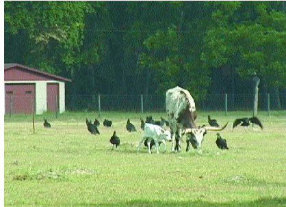
Newborn calves, lambs, and pigs are especially vulnerable to vulture attacks.

NWRC researchers have already developed a number of management tools, with one of the most promising being vulture effigies. Hanging a vulture carcass, taxidermic effigy, or even an artificial decoy from a nearby tree creates an unfavorable roosting environment for vultures and keeps them from returning to the area. While the effect is not permanent, it can be especially beneficial when livestock are birthing their young in the spring.