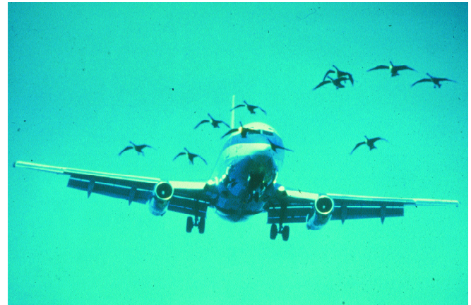
Birds pose the biggest threat to airplanes during takeoff and landing.

WS is recognized internationally for its scientific expertise in reducing wildlife hazards at airports and military bases. Trained WS specialists provided assistance at more than 500 airports in 2002. Before any work is done, however, WS assesses what species are posing the biggest threat and what environmental factors are drawing them to the airport. Changing airport