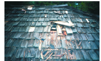
Bird damage to homes, buildings, and historic monuments can be costly to repair and renovate.