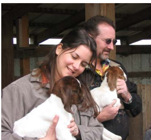
Arkansas extension agents with baby goats.

Until recently, the U.S. market demand for sheep and goats was small. Today, however, we are seeing an increased demand for these small ruminants as more and more producers learn of their benefits in revitalizing family farms.