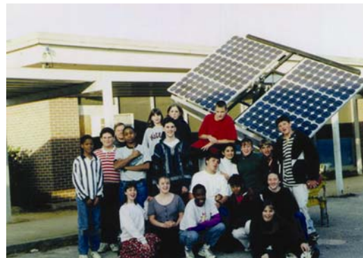
Solar electric systems installed at 27 Montana schools serve as educational tools.

During 2004, NCAT also provided ten senior meals facilities with solar electric systems to reduce energy costs and with energy audits that offered recommendations for operating the facilities more efficiently. Ten communities also received solar electric systems on public buildings such as libraries, city halls, and courthouses.