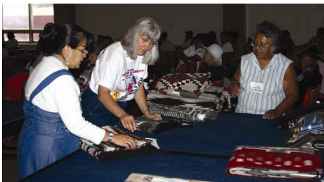
Navajo weavers sell their rugs directly to buyers through a local auction.

The Southwest Marketing Network is funded by the W.K. Kellogg Foundation, USDA Risk Management Agency Outreach, and the Western Region Sustainable Agriculture Research and Education Program.