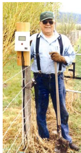
Soil moisture monitors help irrigators water more efficiently and protect Montana rivers.

Goats and sheep are inexpensive to buy and maintain, mature quickly, reproduce rapidly, and do not require a large investment in time or equipment. In addition to providing meat, dairy, and fiber products, sheep and goats have been used to reclaim abandoned or neglected land. Their manure fertilizes the land and they eat many noxious and invasive weeds that cattle do not eat, such as leafy spurge, multiflora rose, and knapweed. Sheep and goats also are an environmentally friendly way to clear brush, to reduce fire danger in residential areas, and to trim back vegetation along waterways, on steep mountainsides, under power lines, and in city parks.