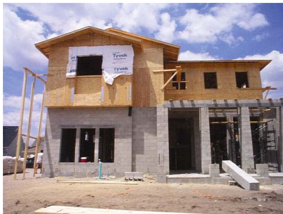
NCAT is working to improve the energy efficiency of new residential construction in Montana.

Through a project with the Northwest Energy Efficiency Alliance that aims to improve residential new construction building in Montana, Oregon, Washington, and Idaho, NCAT staff is establishing and will maintain ENERGY STAR verification, certification, and quality assurance processes in Montana. NCAT presented two successful training workshops for home builders in Montana this year. NCAT staff also will take the lead role in developing training in the four-state area for verifiers and quality assurance specialists, the people who verify that builders meet ENERGY STAR requirements and that the homes perform within ENERGY STAR standards.