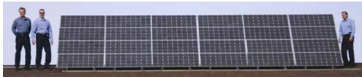
Billings, Montana, firemen pose next to their station's new PV array.

using solar energy. Besides generating clean energy from a renewable resource, the solar projects provide unique educational opportunities for area students and for community members. And, over time, the use of solar power helps those who participate in the projects save money on energy bills.