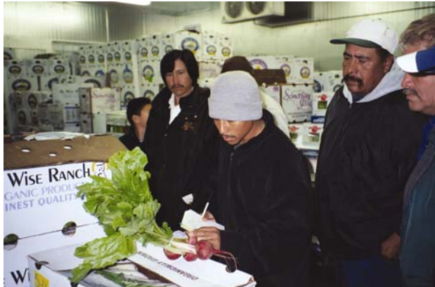
Farmers investigate organic products and packaging as part of NCAT training.

NCAT is working with California farmers – particularly minority farmers and farm workers interested in becoming farmers – in a package of projects designed to improve their access to the organic market. In a partnership with the Agriculture Marketing Organization and Farm and Agriculture Collaborative Training Services, for example, NCAT staff developed a workshop, presented in Spanish, that focused on risk management for Latino organic growers. Participants learned how to keep records, plan and plant for their market niche, and market to potential customers. The training included a trip to the wholesale terminal markets in San Francisco to visit organic produce buyers. There farmers learned what products buyers want and how they want them packaged and presented. Workshop participants also visited the California Farm Service Agency, where they learned about the paperwork the agency requires for loan and grant applications.