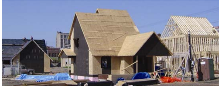
Homes in the Pine Street Neighborhood combine energy efficiency, affordability, and sustainability.

Since 2001, NCAT has been a partner in the planning of the Pine Street Neighborhood project in Hazleton, Pennsylvania to build 24 affordable and sustainable homes that create a pedestrian-friendly environment and help facilitate a community spirit that emphasizes safety and security. The homes replace a vacant, decaying, industrial three-block area of downtown Hazleton. This year, NCAT provided technical assistance to the project with funding from the U.S. Department of Housing and Urban Development, and is currently certifying the homes as ENERGY STAR® compliant.