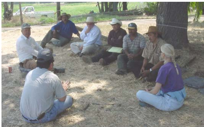
NCAT staff discuss organic agriculture with California farmers.

In a similar project, NCAT teamed up with California Farmlink, the California Human Development Corporation, and the Farmworker Institute for Education and Leadership Development to teach Cambodian and Latino growers, farm workers, beginning farmers, and others interested in becoming farmers about the best techniques for record keeping in organic agriculture. Funded by the U.S. Department of Agriculture, the project also introduces participants to the new and rapidly growing market for organic farm products.