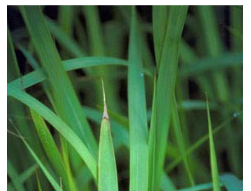
Leaves are yellowgreen blades about an inch wide and have sharp-pointed tips.

Cogongrass is an aggressive perennial grass that grows from 2 to over 4 feet in height, in full sunlight to partial shade.