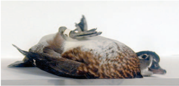
Figure 1. A female wood duck with severe neurologic clinical signs of disease after intranasal inoculation with an Asian strain of highly pathogenic avian influenza H5N1 virus.

distribution of lesions were the same for both H5N1 viruses, with the following exception described below.