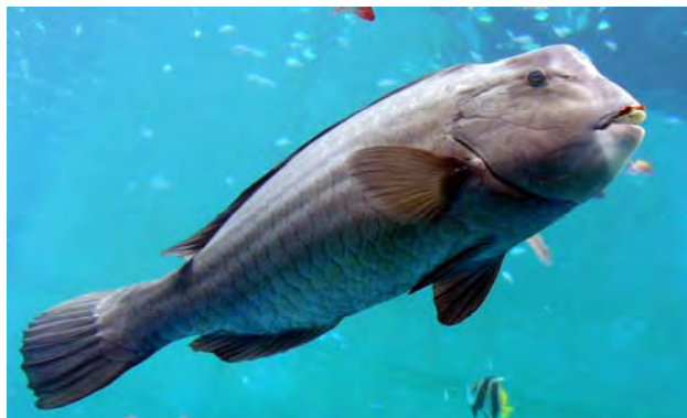
Churaumi Aquarium Ocean Expo Park, Okinawa, Japan.

specific monitoring by NMFS and the Western Pacific Regional Fishery Management Council in U.S Pacific areas.