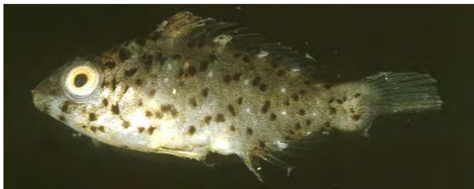
Figure 2. Juvenile, New Caledonia.