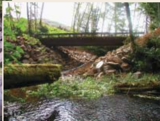
East Humbug Creek, after bridge