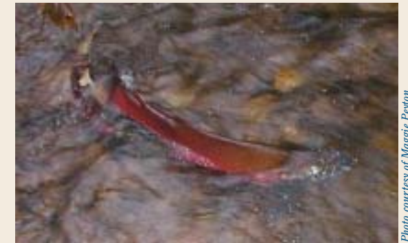
A spawning coho