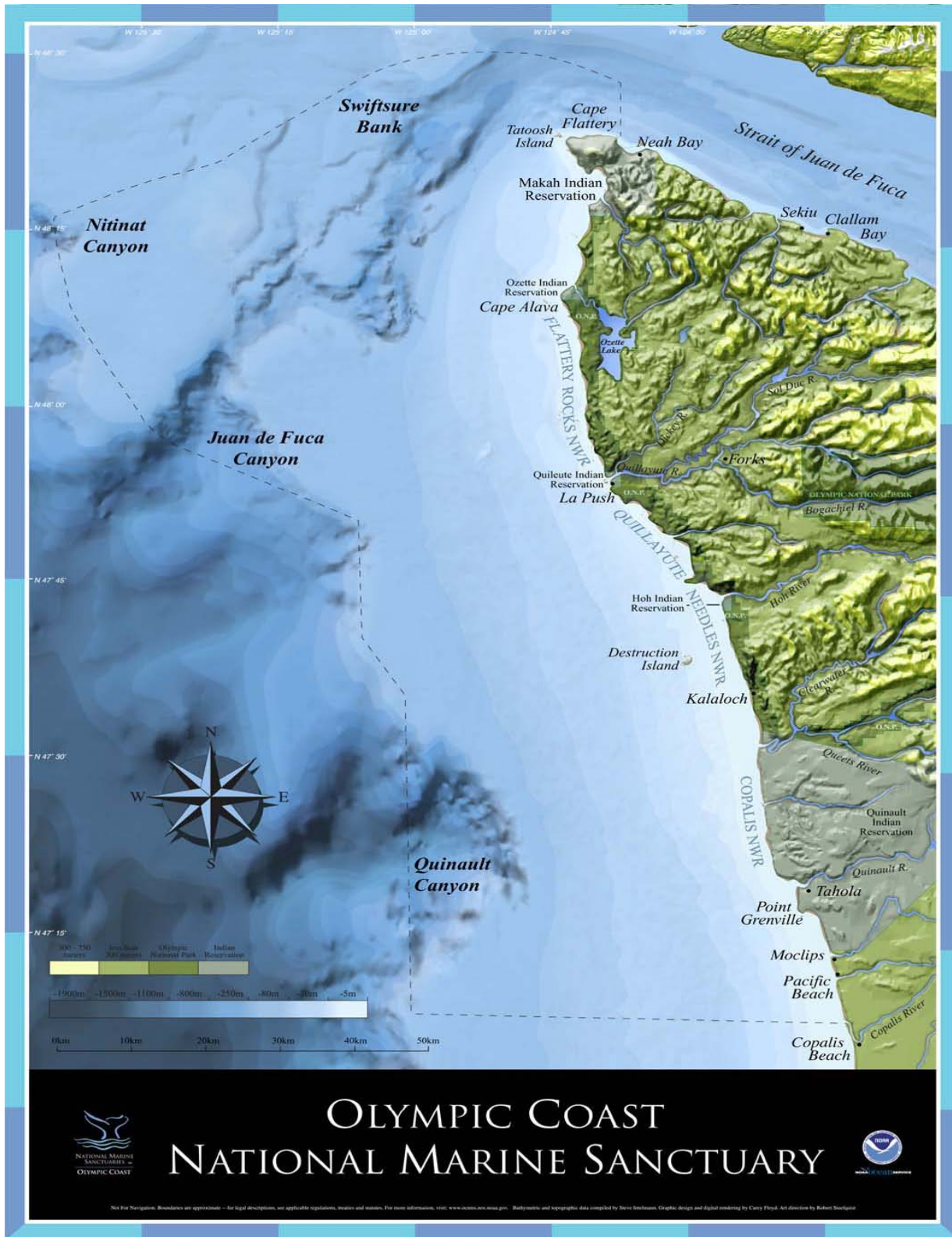
Figure 1. Map of Olympic Coast National Marine Sanctuary.

The OCNMS was designated as a national marine sanctuary in 1994. The overall goal of the sanctuary is to conserve, protect, and enhance its natural and cultural resources through effective research and educational programs, and by encouraging compatible commercial and recreational uses. Certain activities are prohibited within the sanctuary in order to help protect its resources (Table 1).